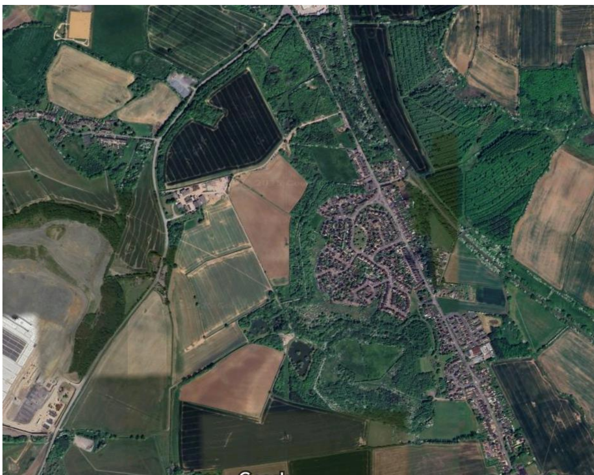
Figure 2: Setting of skylark mitigation area in relation to the Site. Source: www.google.co.uk accessed 18-08-2025. NTS.