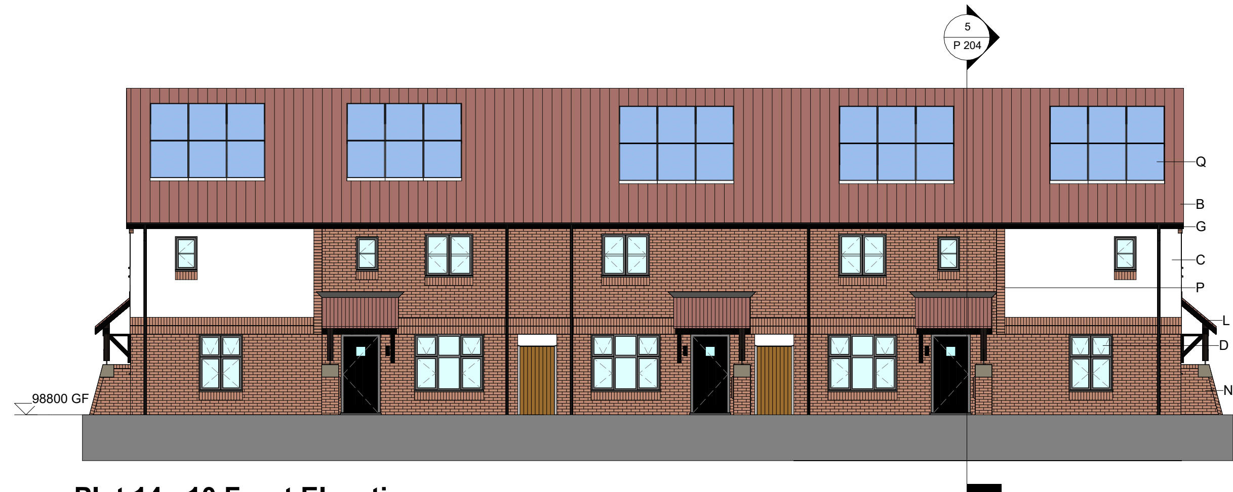
Plot 14 - 10 Front Elevation 1 : 100