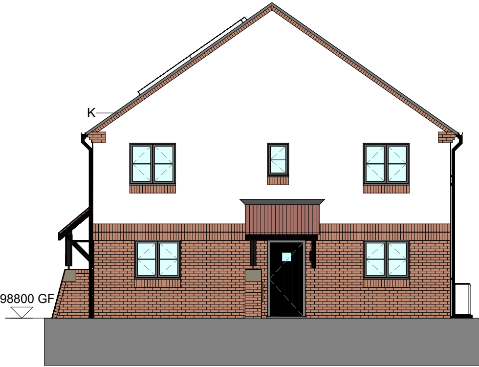
Plot 10 Front Elevation 1 : 100