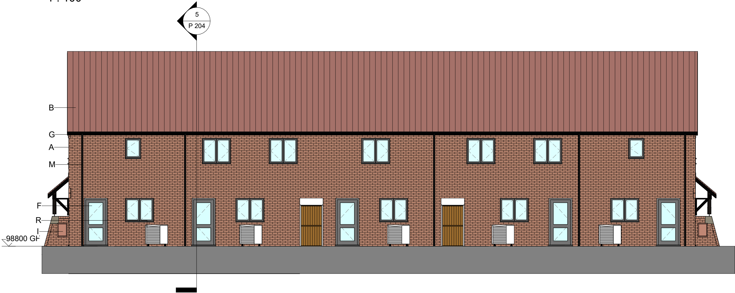
Plot 10 - 14 Rear Elevation 1 : 100