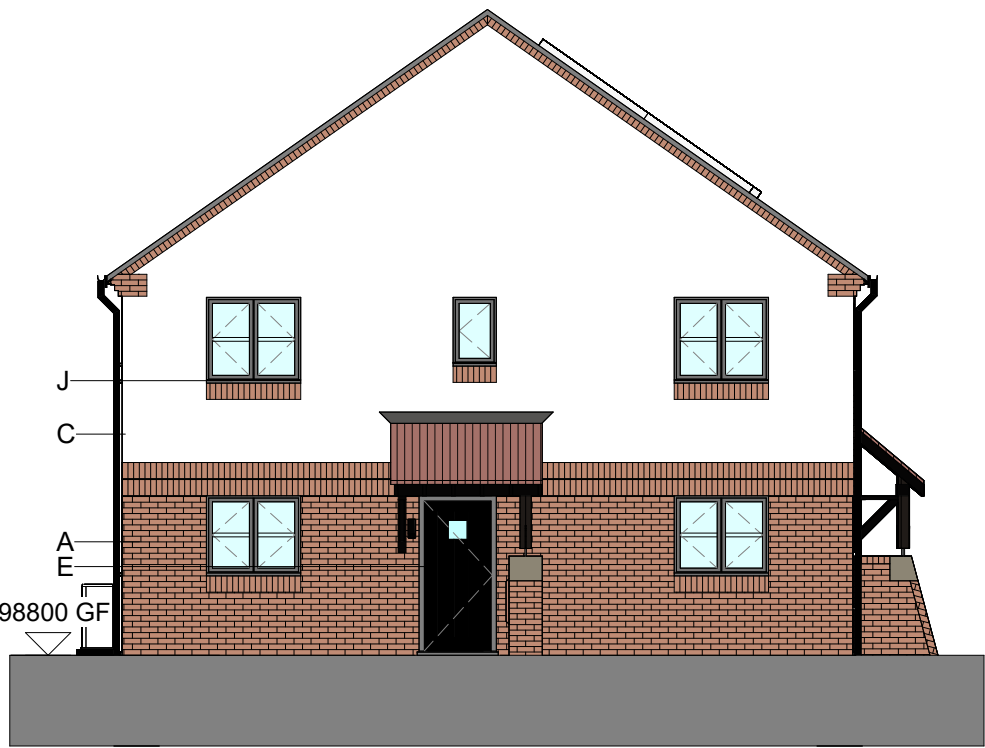
Plot 14 Front Elevation 1 : 100