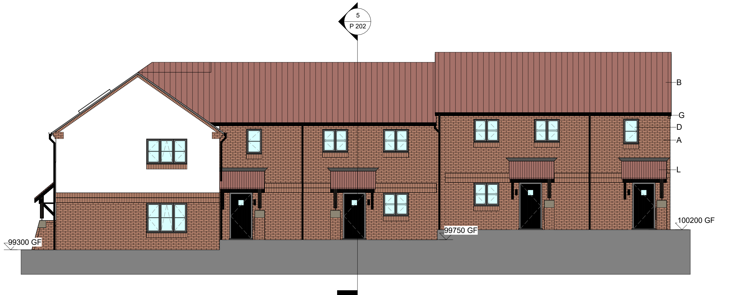
Plot 4 - 9 Front Elevation 1 : 100