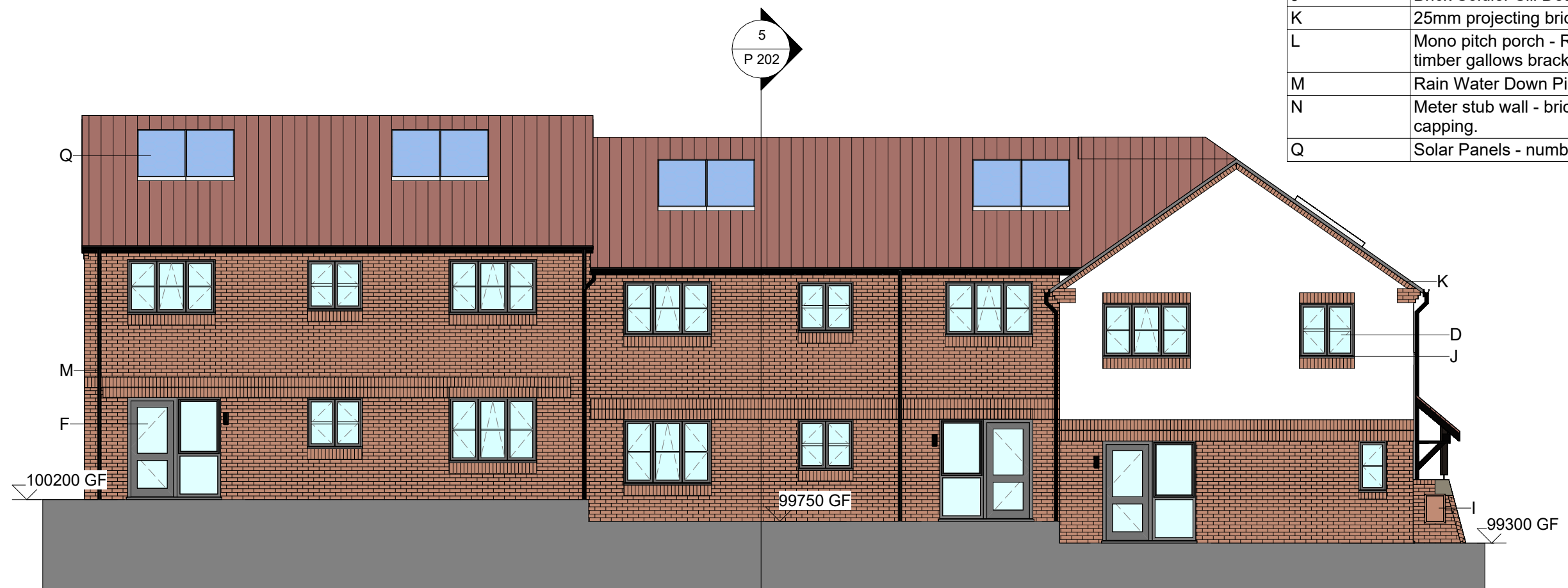
Plot 4 - 9 Rear Elevation 1 : 100