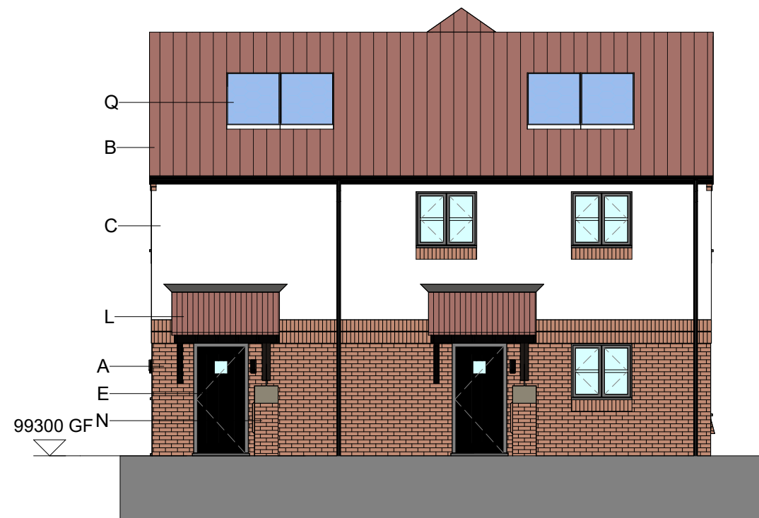
Plot 6 & 9 Front Elevation 1 : 100