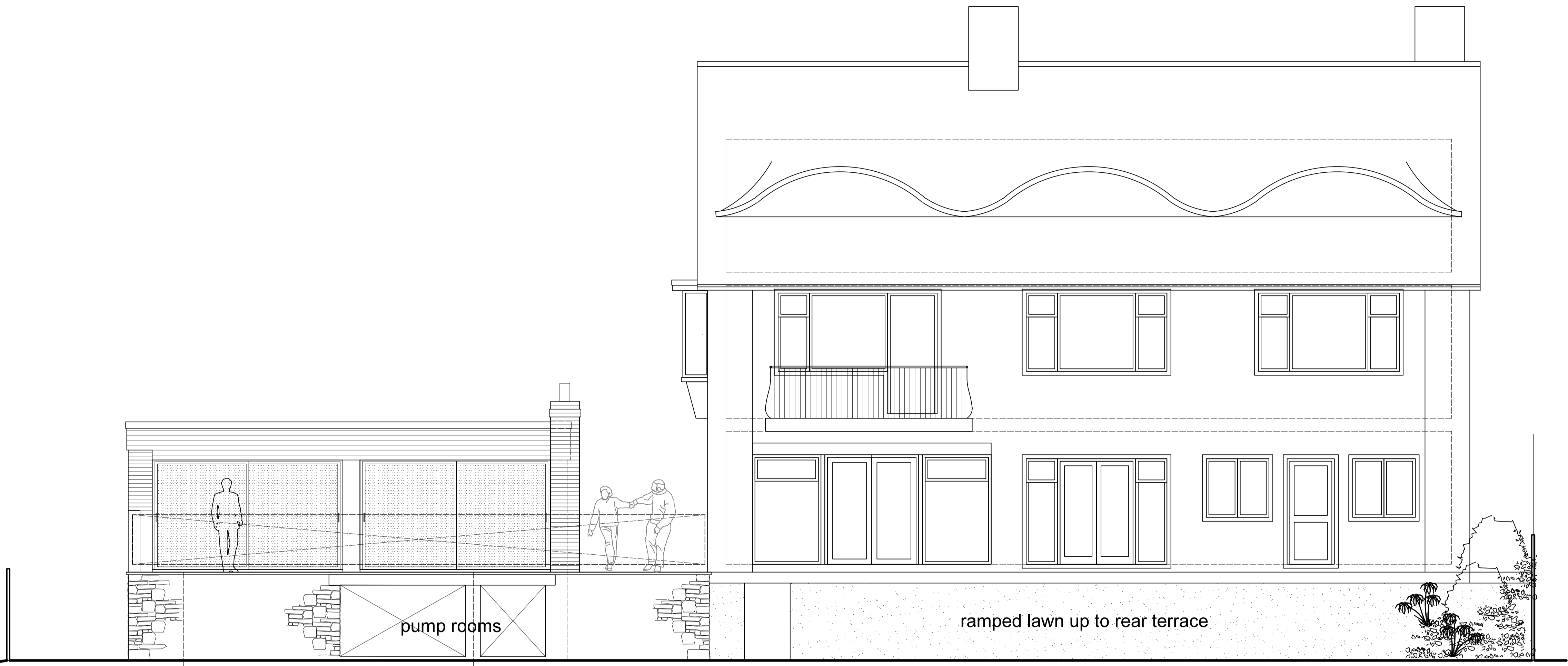
front elevation- south west

Materials/finishes: POOL House Roof: torch on mineral felt roof finish to falls. Walls: Generally - random stone facing to garden elevations with fairfaced brick piers between glazed sliding doors. Blind elevation (North West facing fields) are sand cement render painted. Perimeter of roof finished with stained shiplap timber fascia to all elevations. Sliding doors: Generally natural aluminium sliding double glazed doors in stained timber subframe. Fascias: stained timber generally. Rainwater and plumbing: black plastic rectangular profile. Circular downpipes.