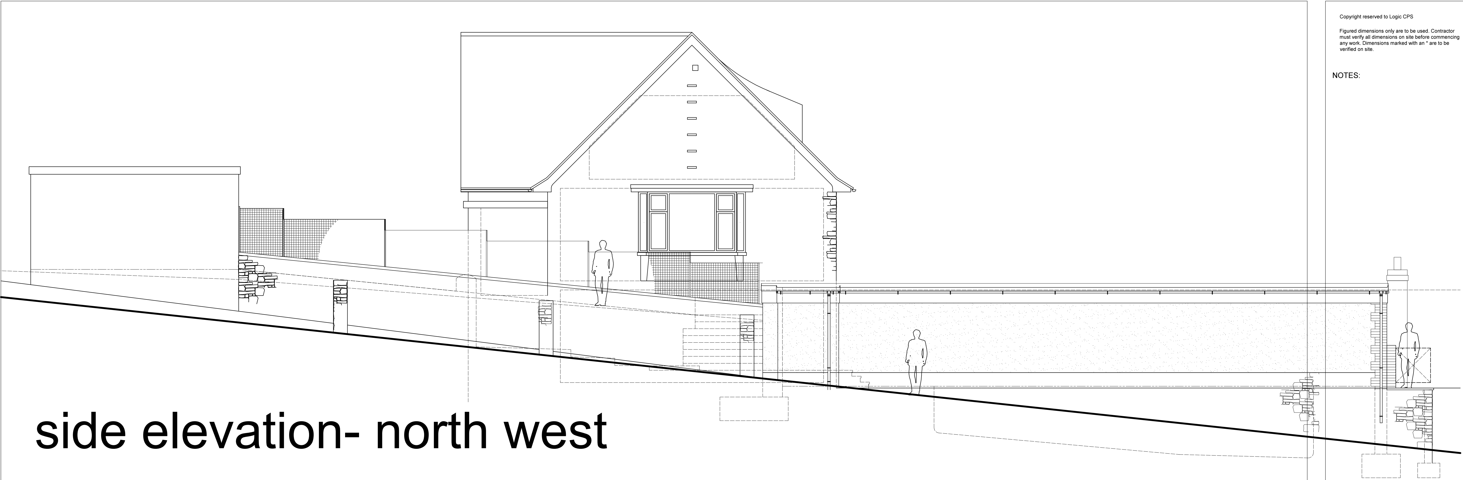
side elevation- north west