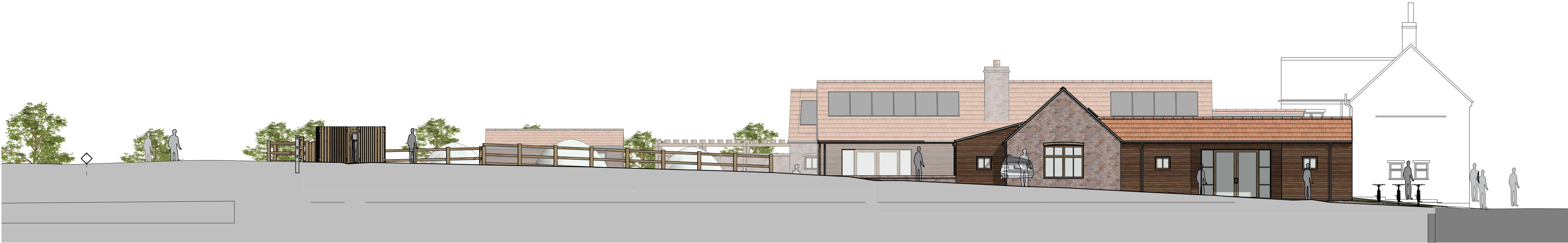
Street Elevation to North Es-02