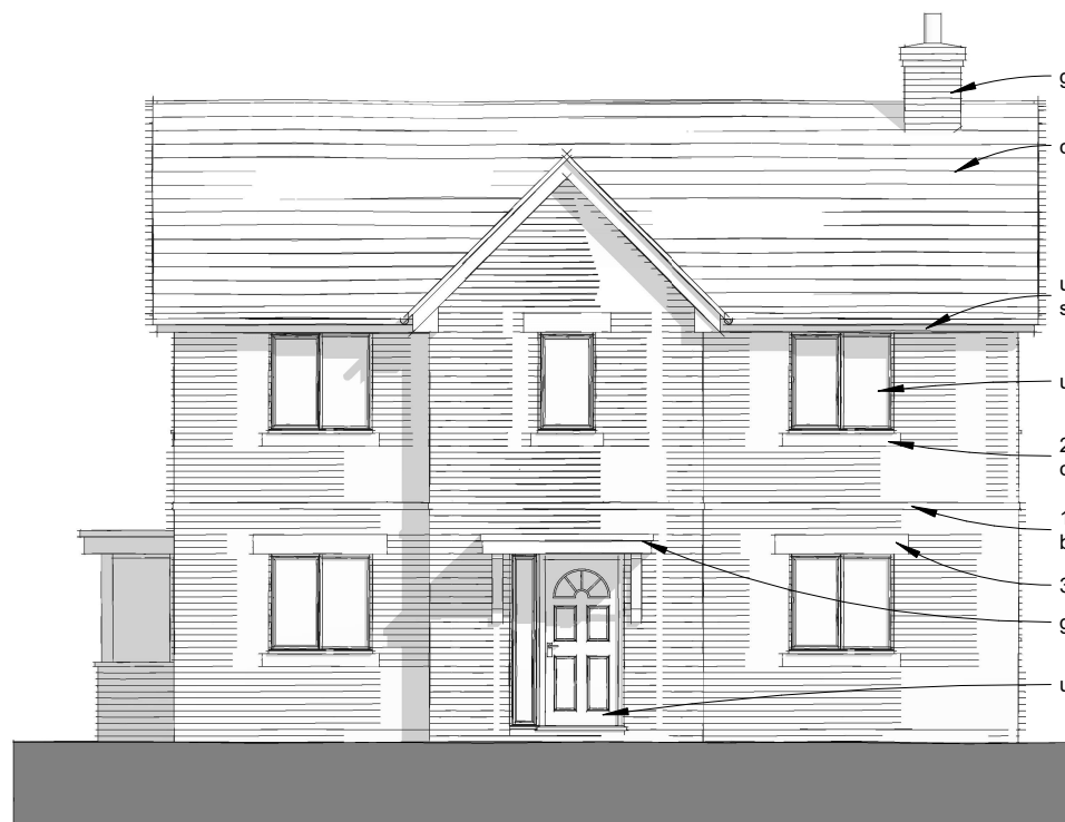
Proposed Side Elevation.