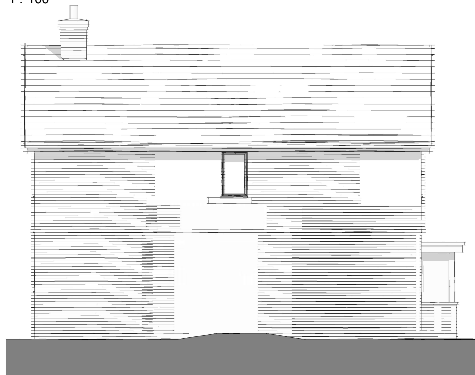
Proposed Side 2 Elevation.