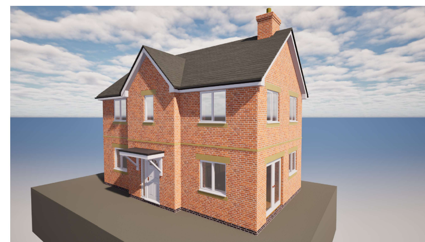
Illustrative 3D Visual 2