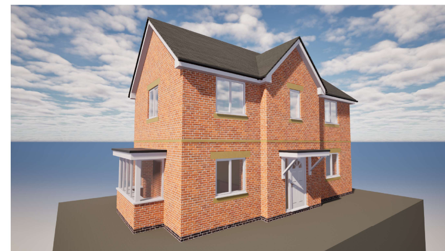
Illustrative 3D Visual 1