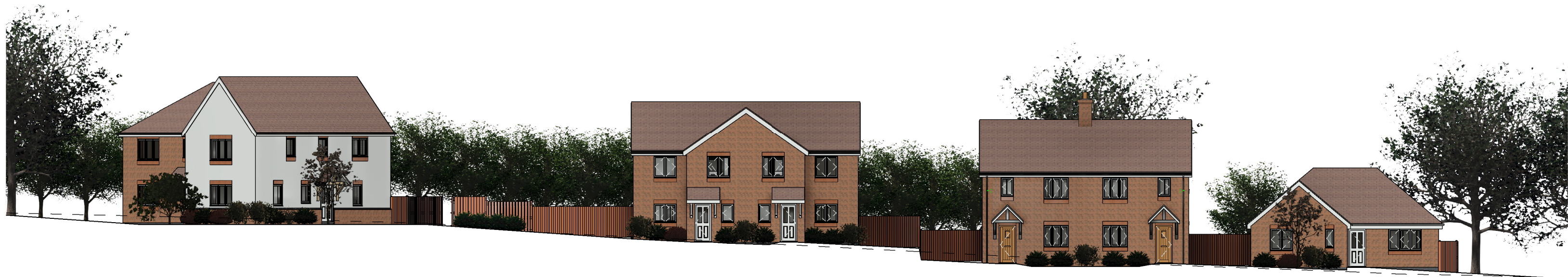
Section 4 1 : 200