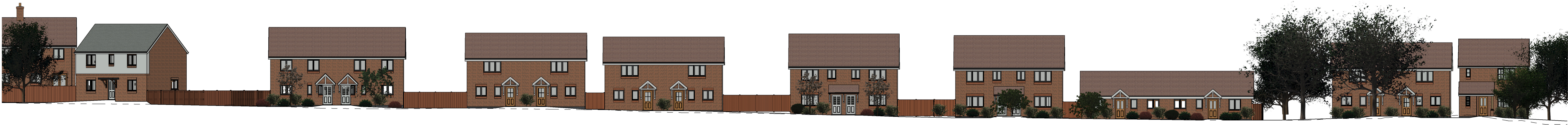
Section 1 1 : 200