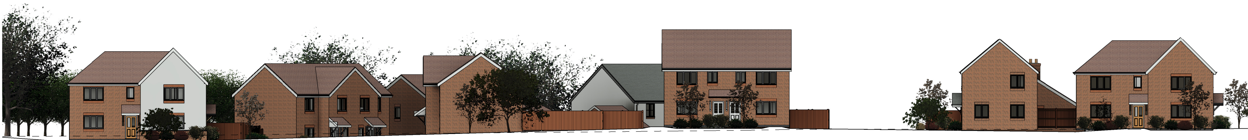
Section 3 1 : 200