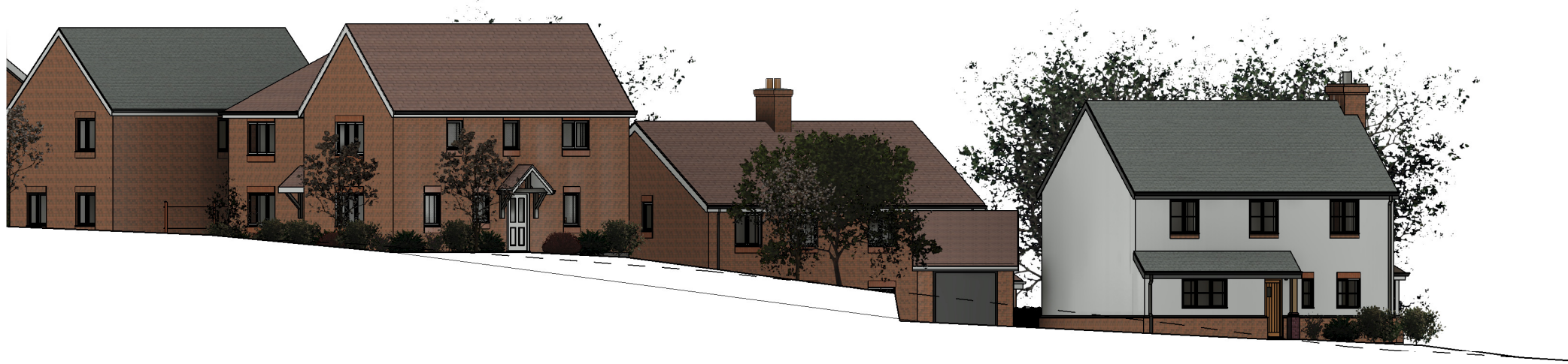
Section 2 1 : 200