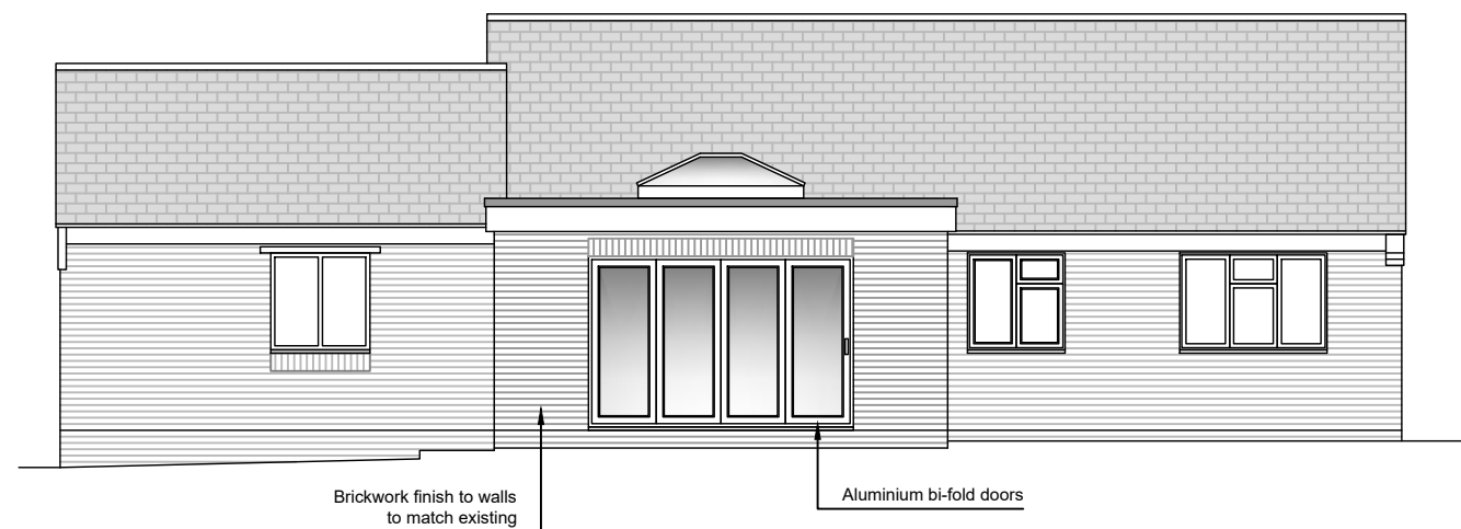
Proposed Right Elevation

Brickwork finish to walls to match existing