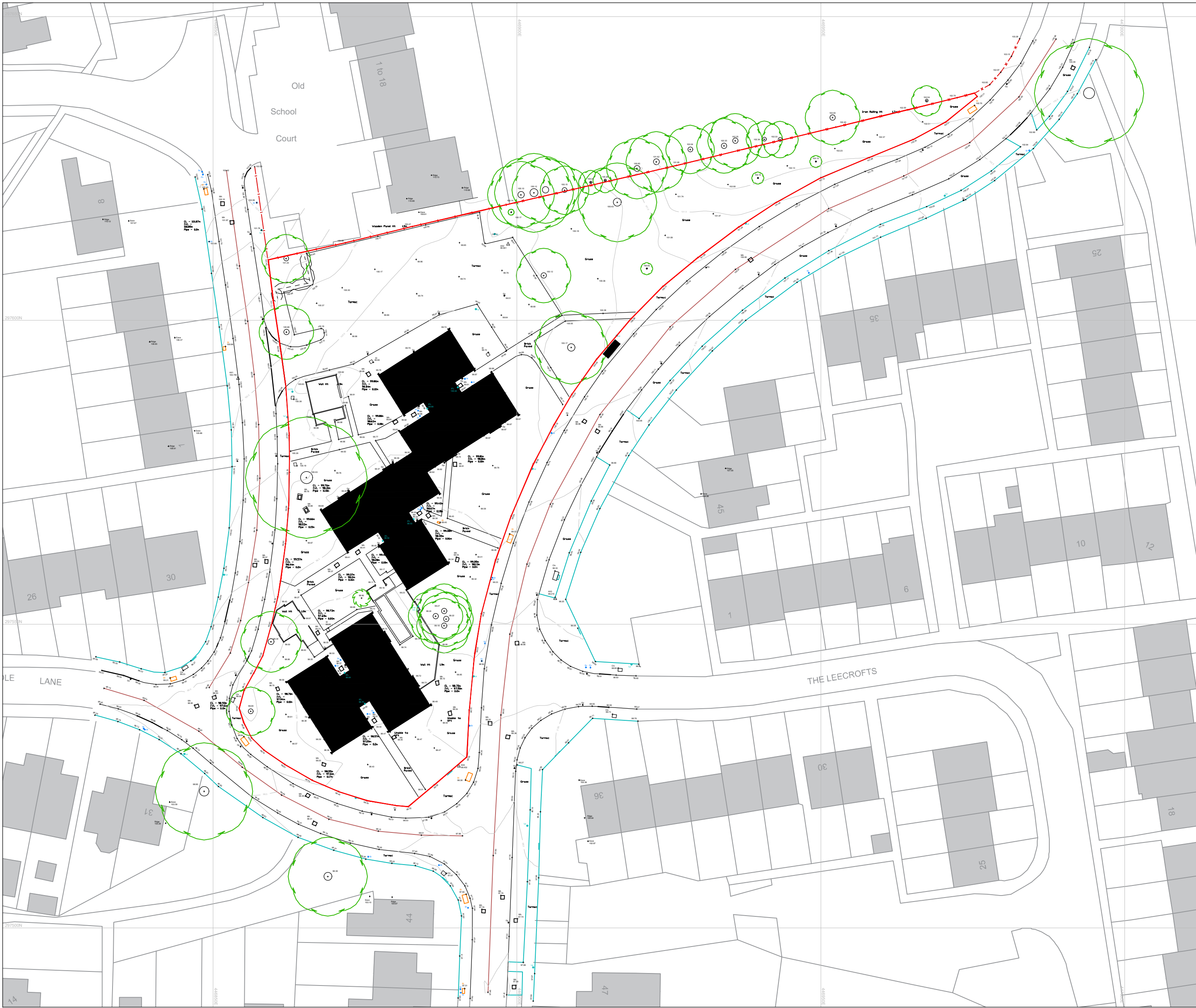
Existing Site Plan Scale 1:500