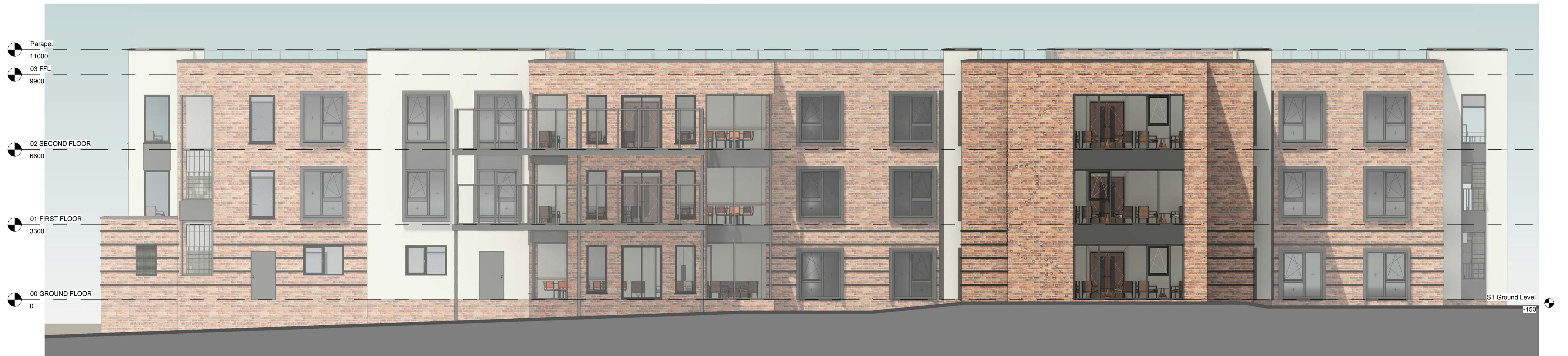
South East - Trinity Lane Elevation 1 : 100