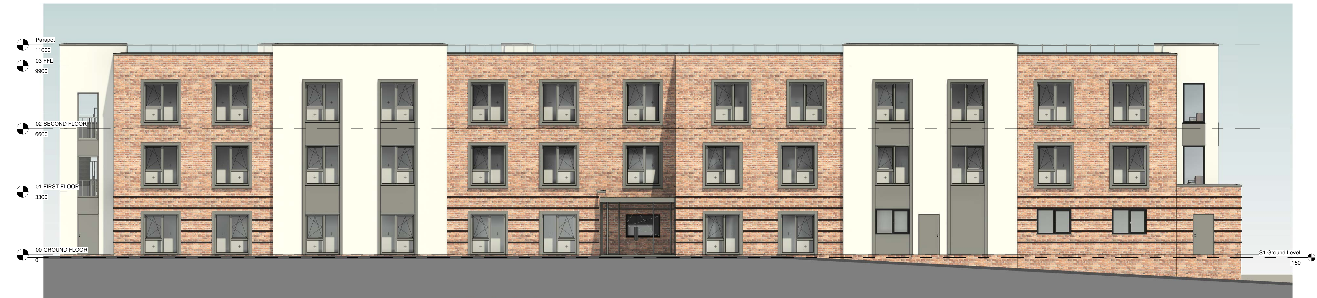
North West - Entrance Elevation 1 : 100