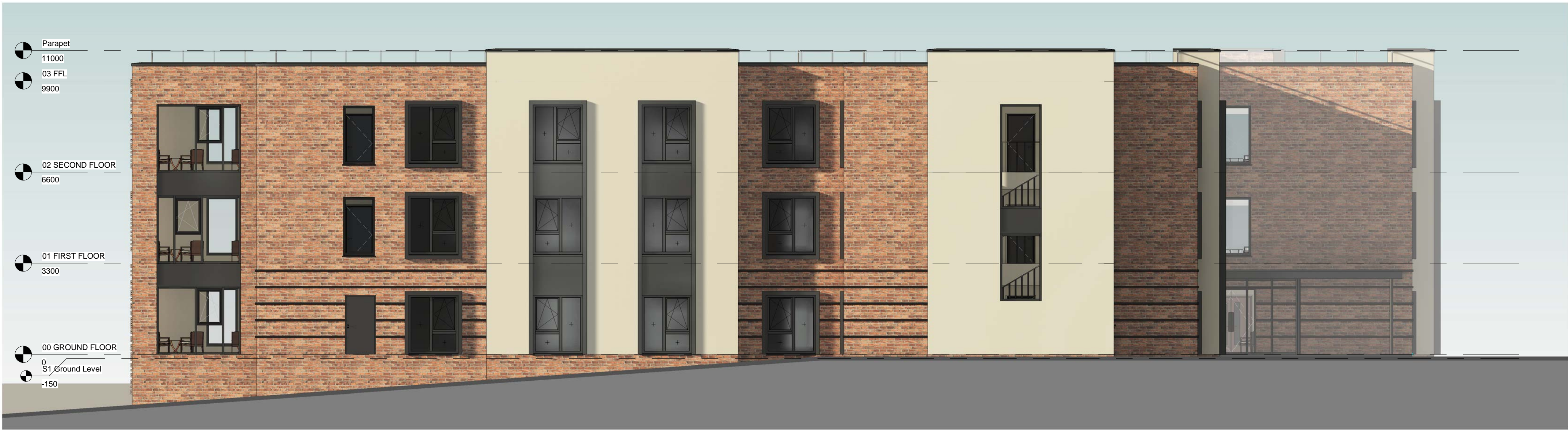
North East Elevation 1 : 100