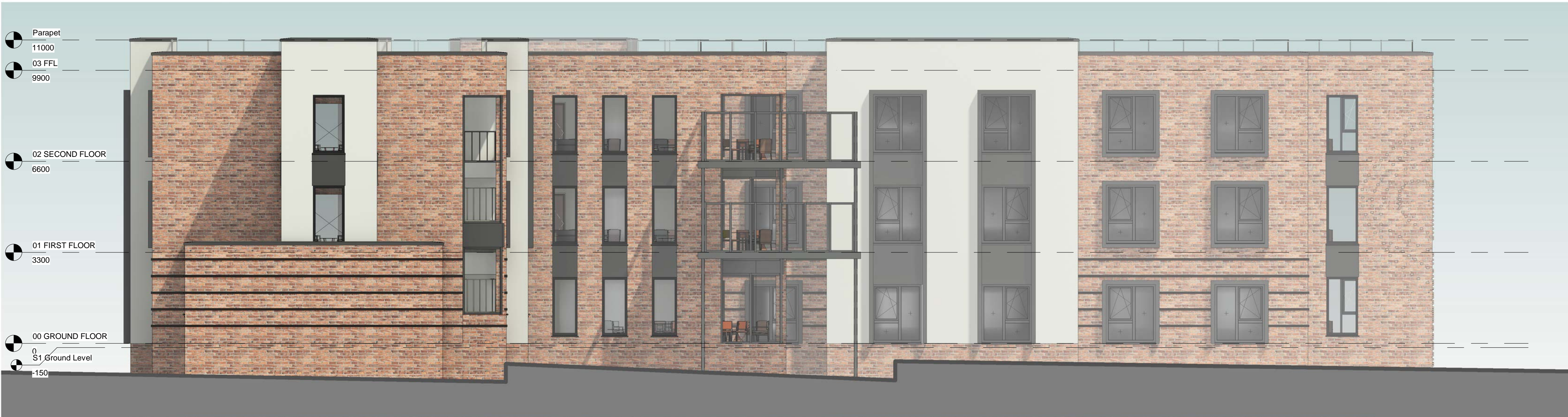
South West Elevation 1 : 100

Facing Masonry Ibstock Birtley Olde English or similar