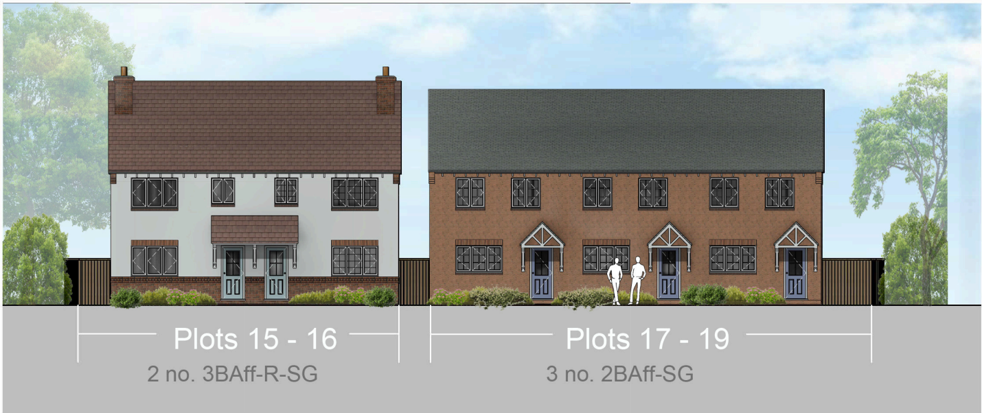
Street Elevation C-C