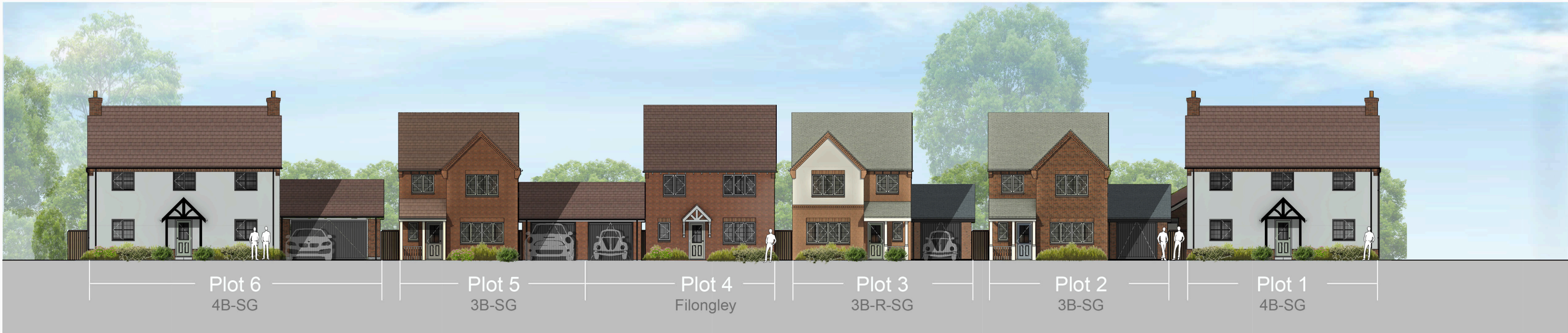
Street Elevation A-A