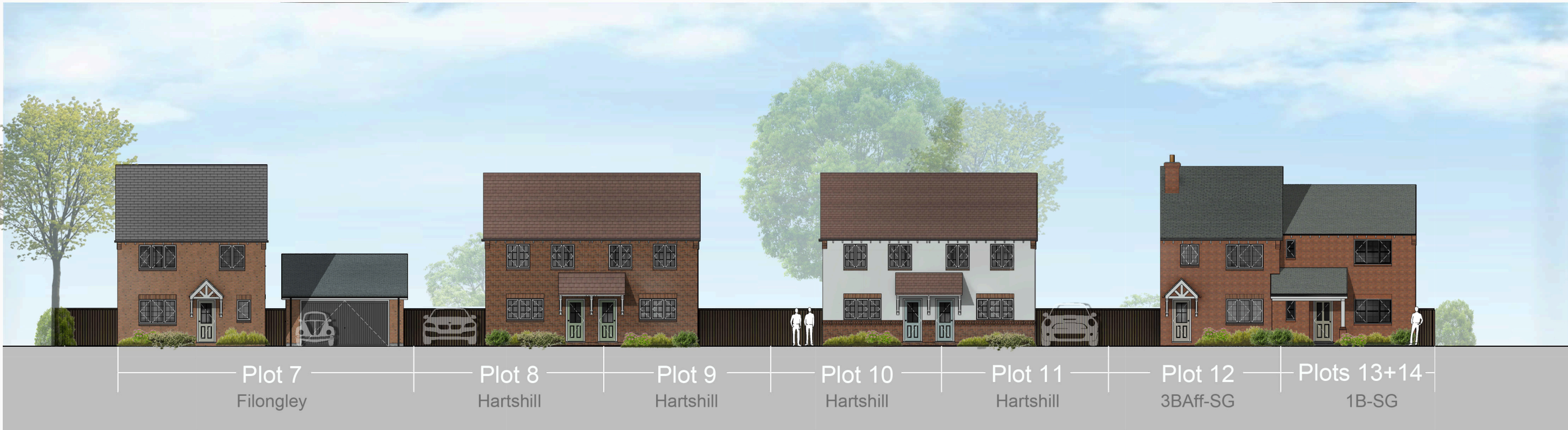
Street Elevation B-B