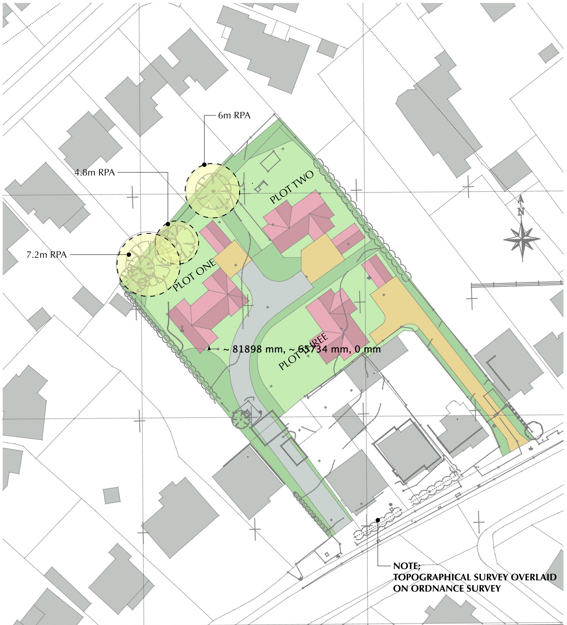
1:500 SITE PLAN SHOWING ROOT PROTECTION AREAS (RPA)