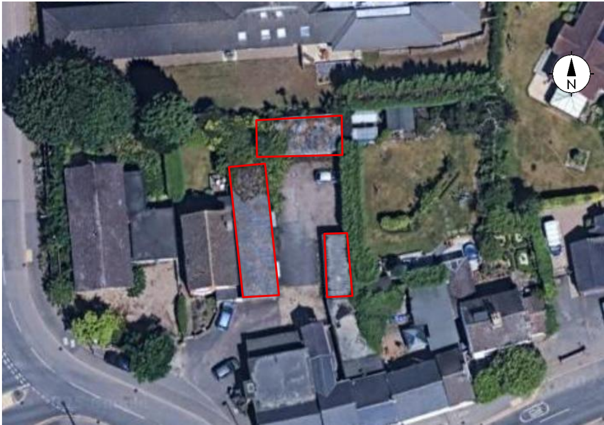
Figure 2: An aerial photograph of the surveyed site (yellow star) and some of the nearby habitats