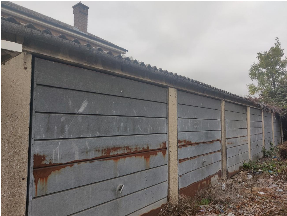
Plate 6: Further view of front of the garages to be demolished.