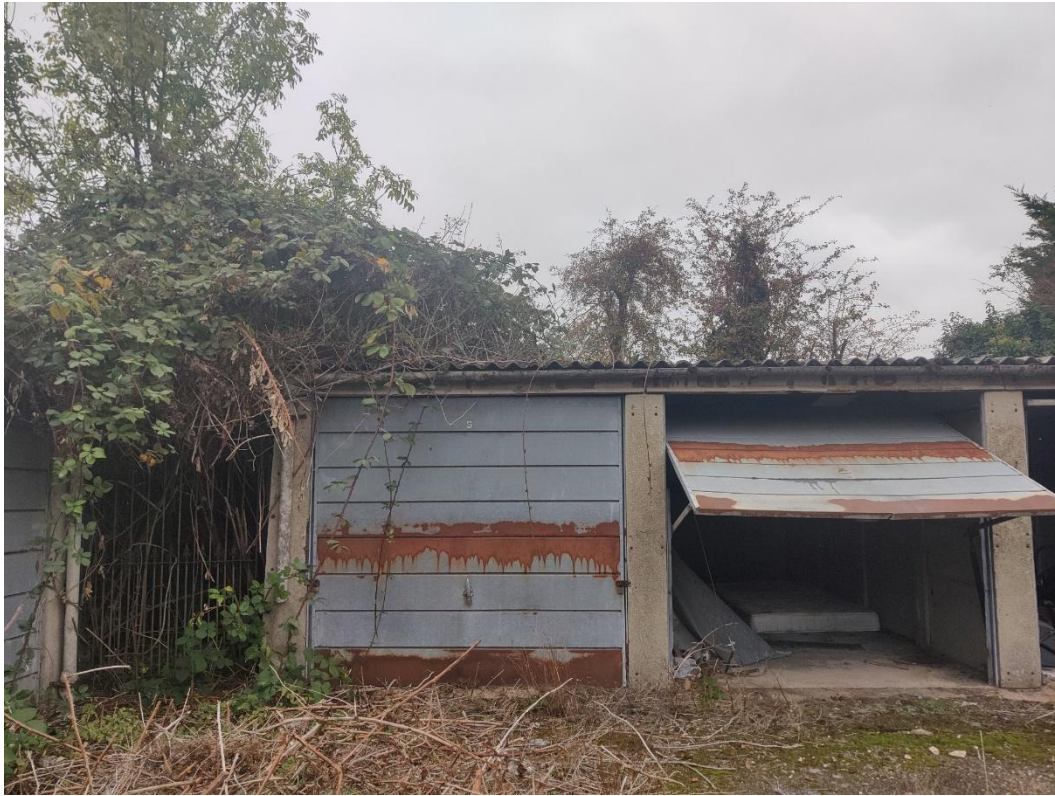
Plate 8: View of some of the open garages which were inspected internally.