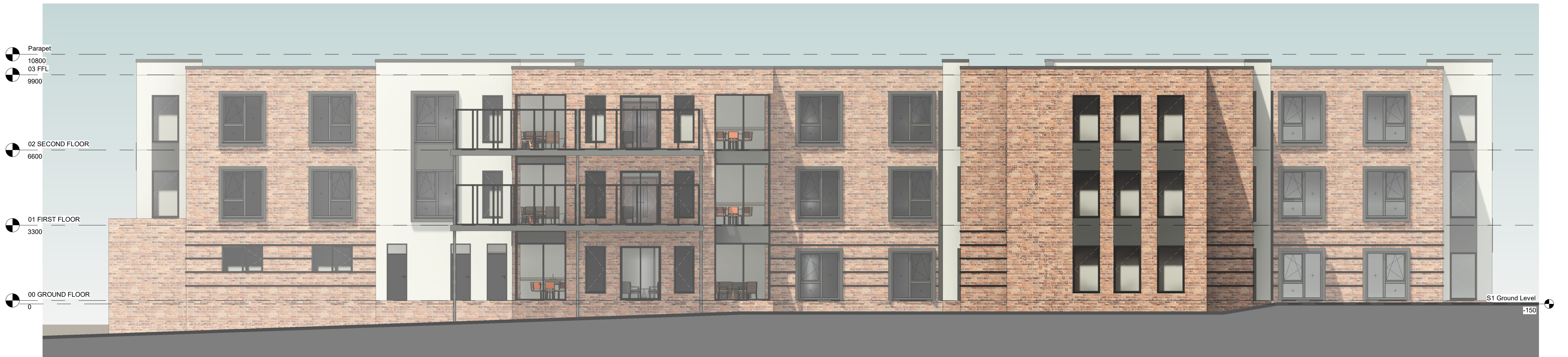
South East - Trinity Lane Elevation 1 : 100