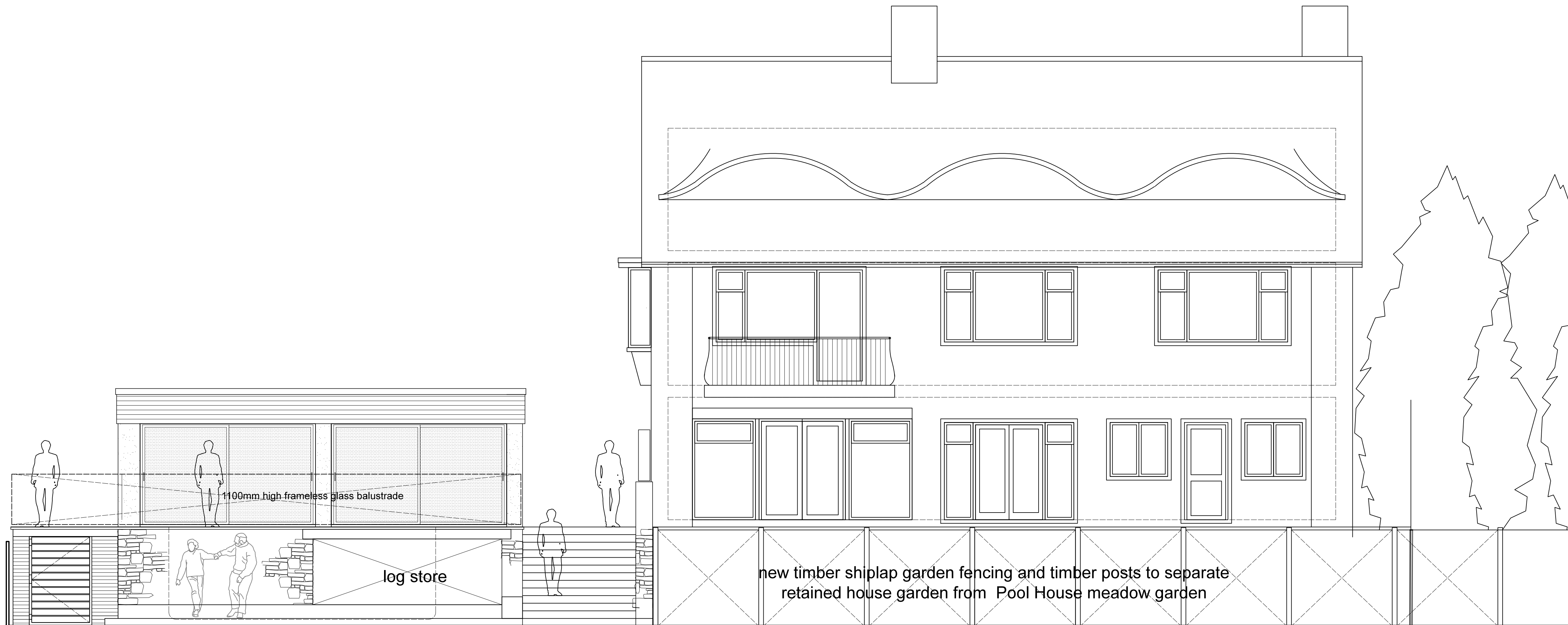
front elevation- south west

Rainwater and plumbing: black plastic rectangular profile. Circular downpipes.