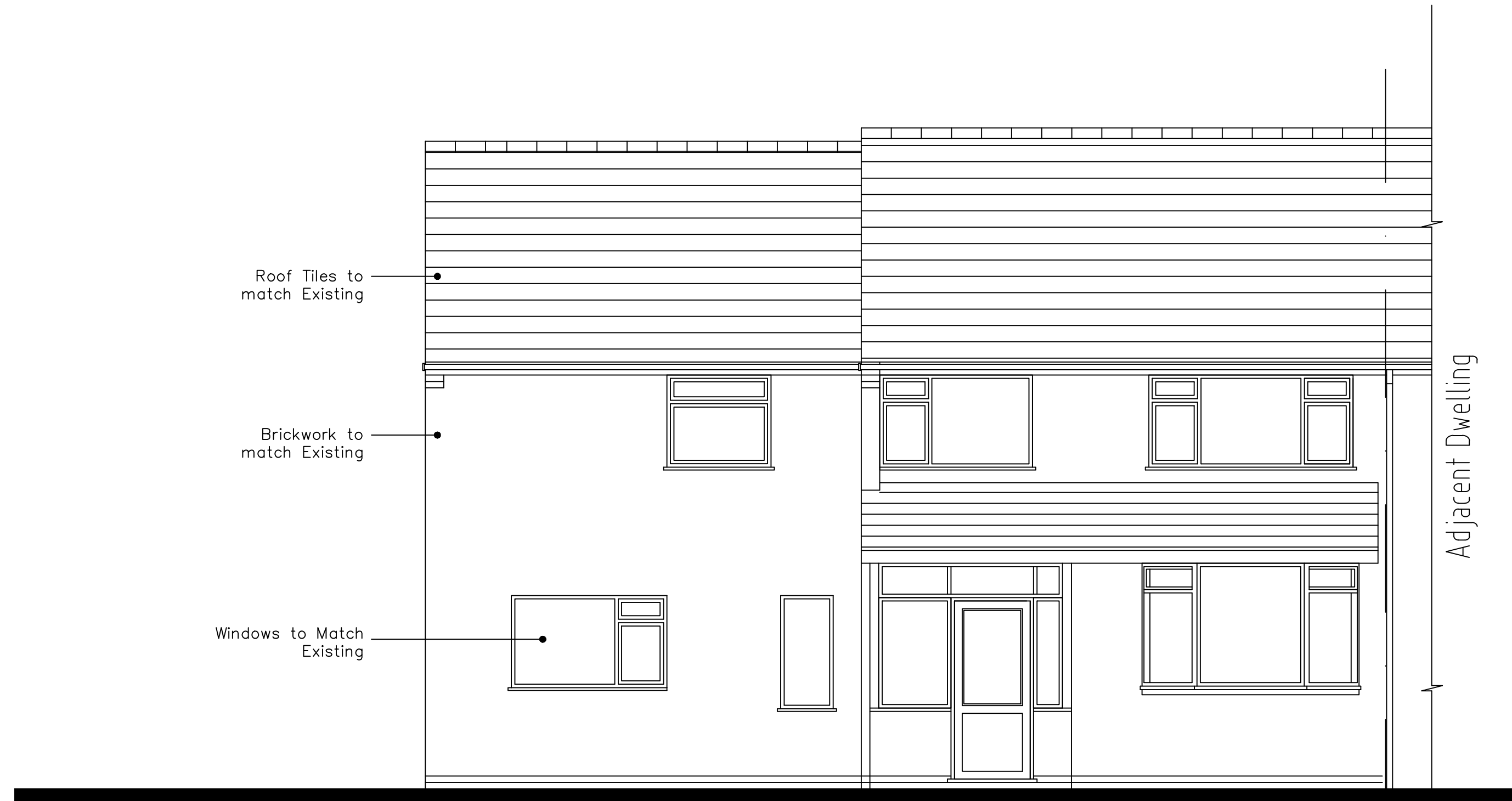
Proposed Front Elevation Scale 1:50