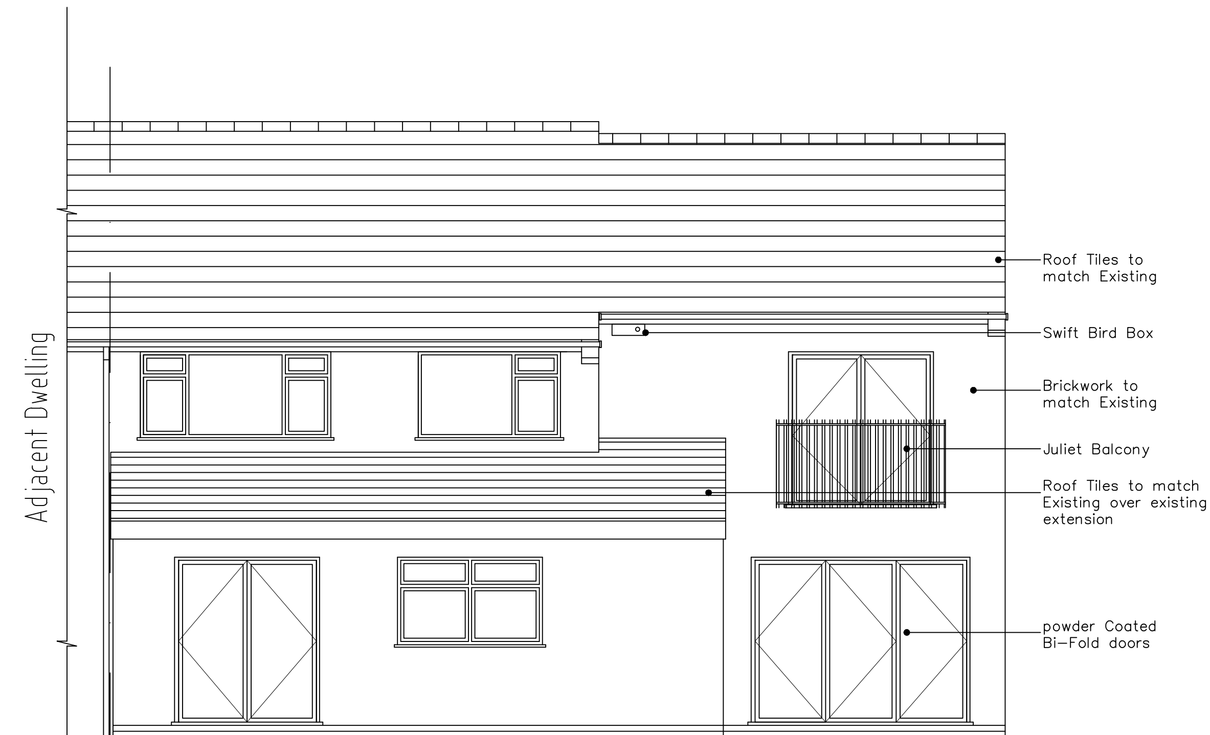
Proposed Rear Elevation Scale 1:50