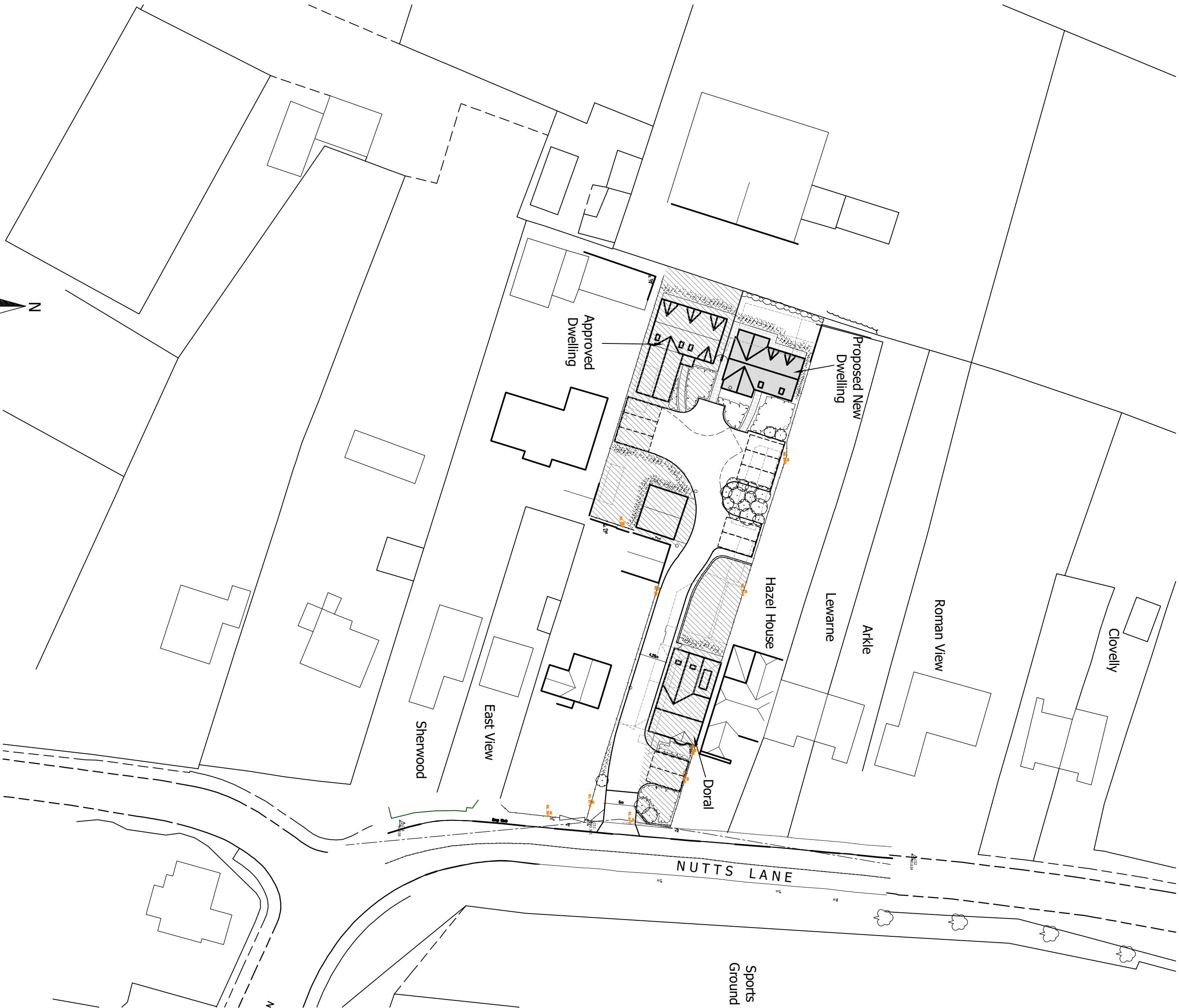
Proposed Block Plan Scale 1:500 1:500 0 10 20 30 Metres