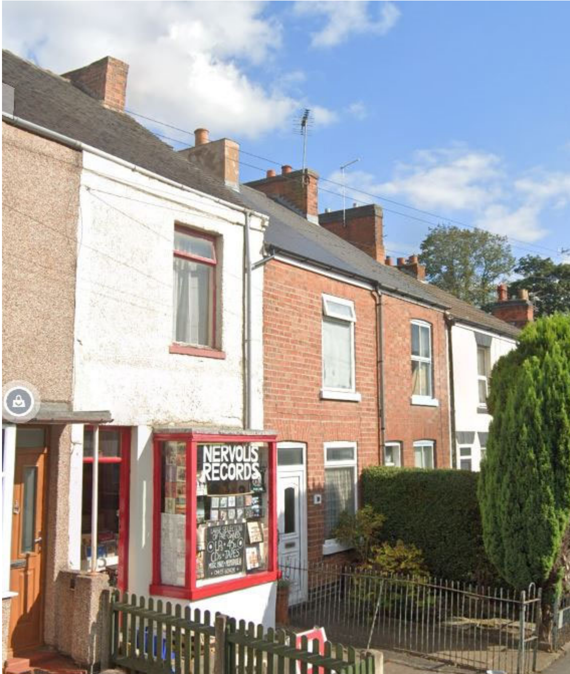
Fig. 2 - No. 16 and 18 The Lawns – Front Elevation