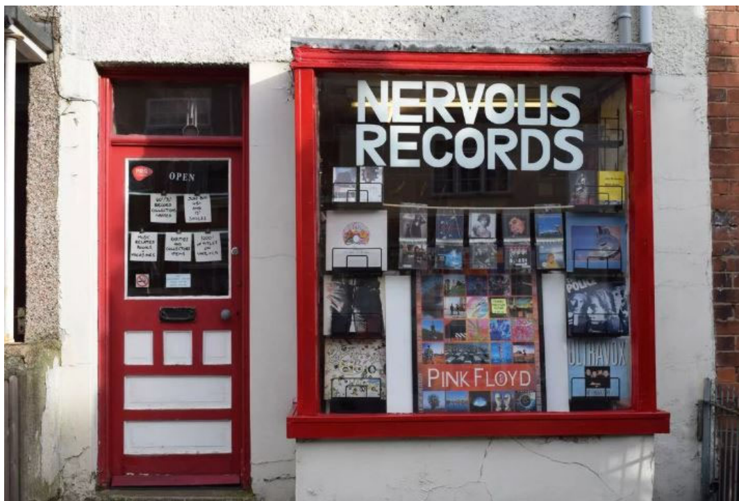
Fig. 1 – No. 16 The Lawns

The properties were not well maintained over recent years and have fallen below a good standard of repair along with numerous outbuildings within the gardens to the rear, with the gardens largely left to overgrow.