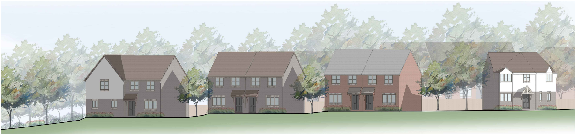
Plot 31 Plot 32 Plot 33 Plot 34 Plot 35 Plot 36 Plot 37