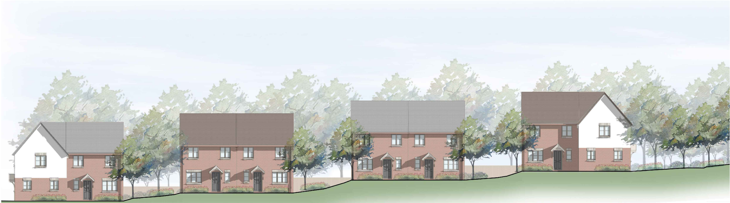
Plot 67 Plot 66 Plot 65 Plot 64 Plot 63 Plot 62 Plot 61 Plot 60