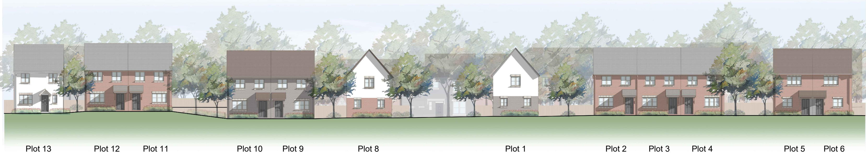
Street Scene A-A