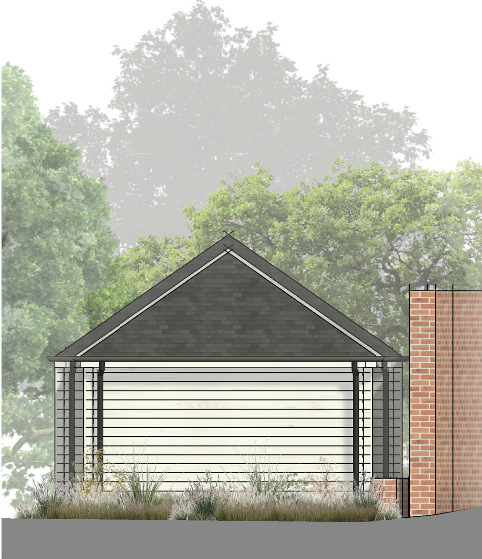
Building 02 - Elevation 04 1 : 50