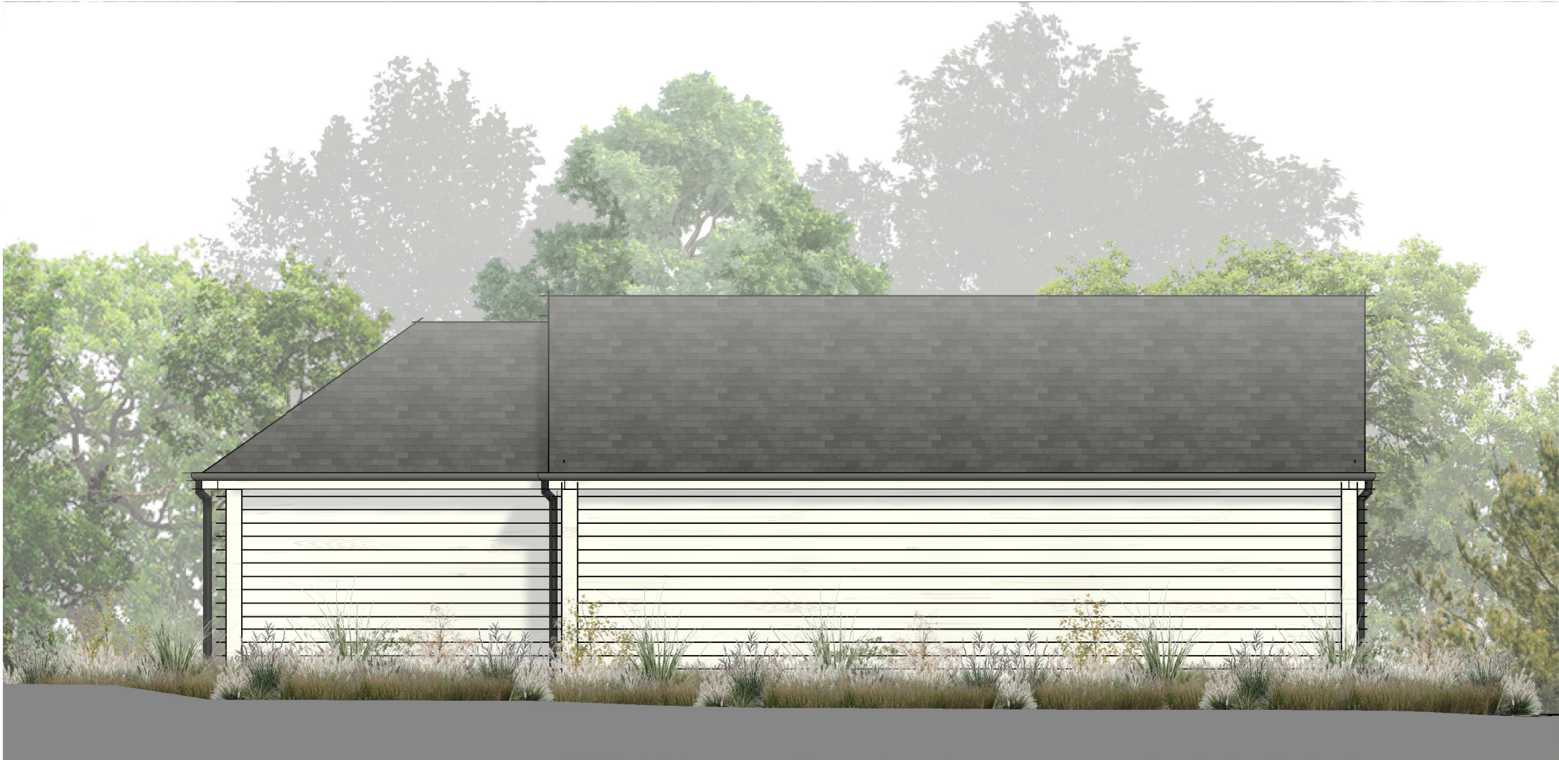
Building 02- Elevation 02 1 : 50