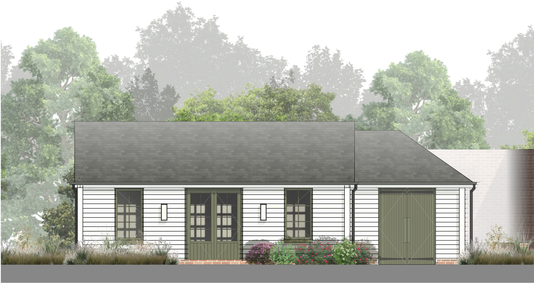
Building 02 - Elevation 01 1 : 50