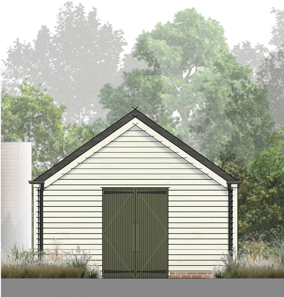
Building 02- Elevation 03 1 : 50