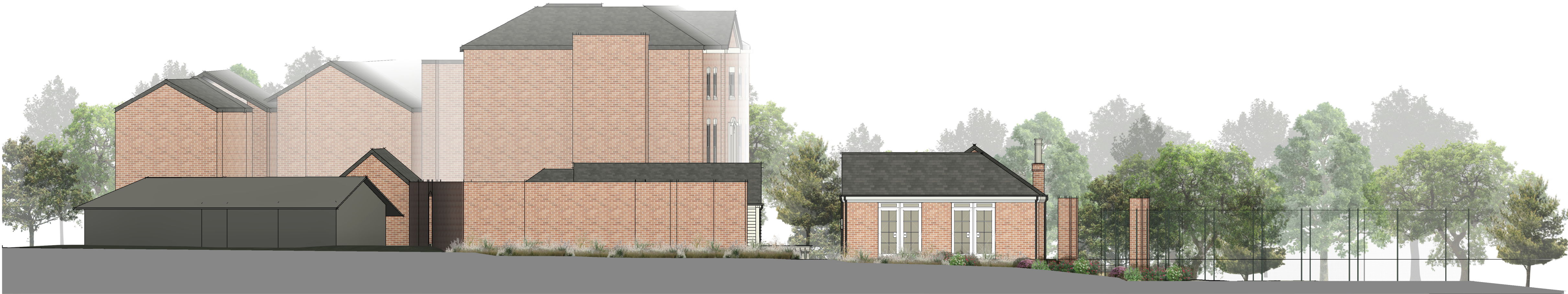
Proposed Site Elevation 02 1 : 100