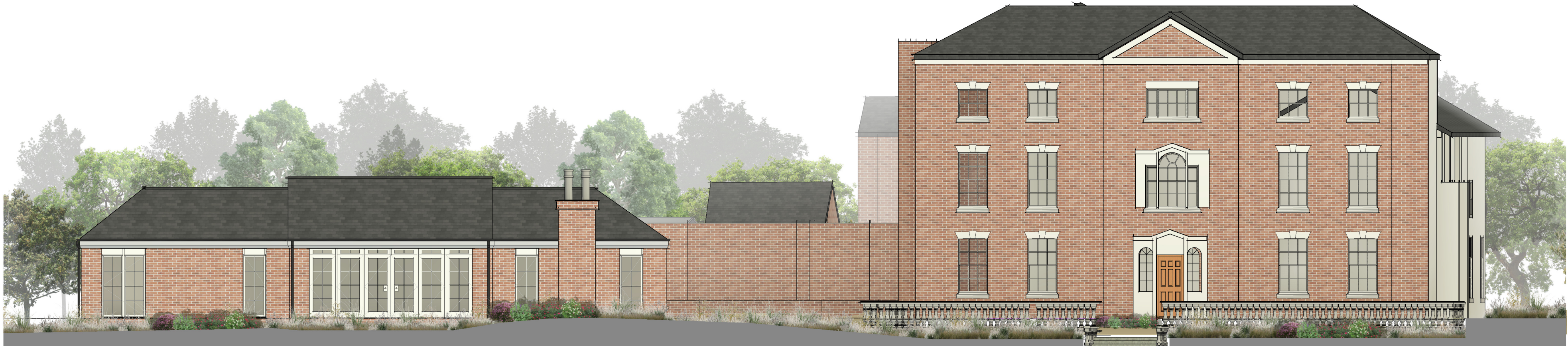
Proposed Site Elevation 01 1 : 100