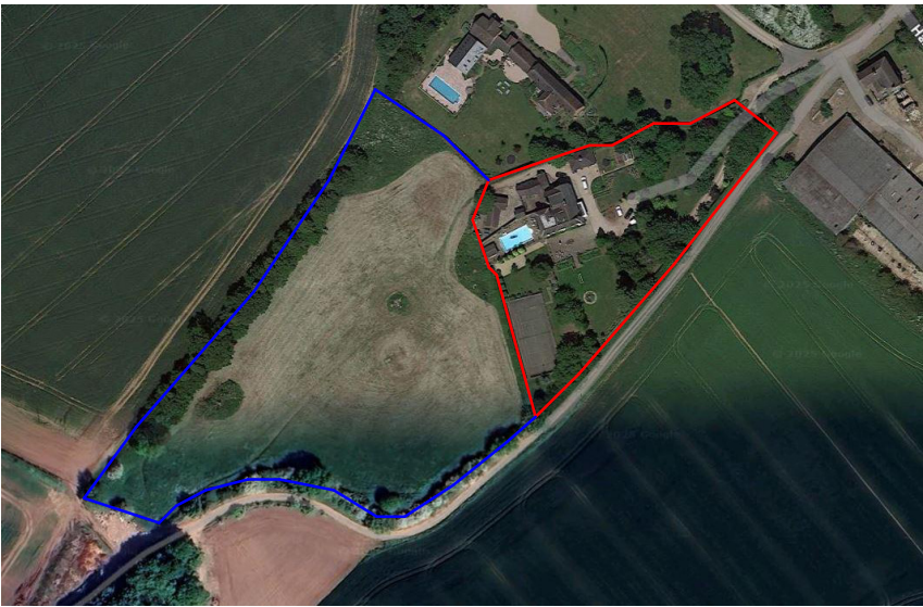
Location Plan - Sateliette Image - NTS