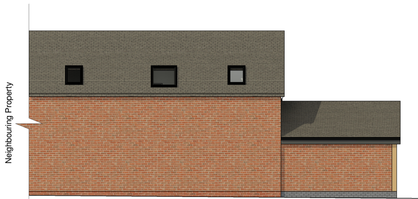
Rear Elevation - Facing Lount Road