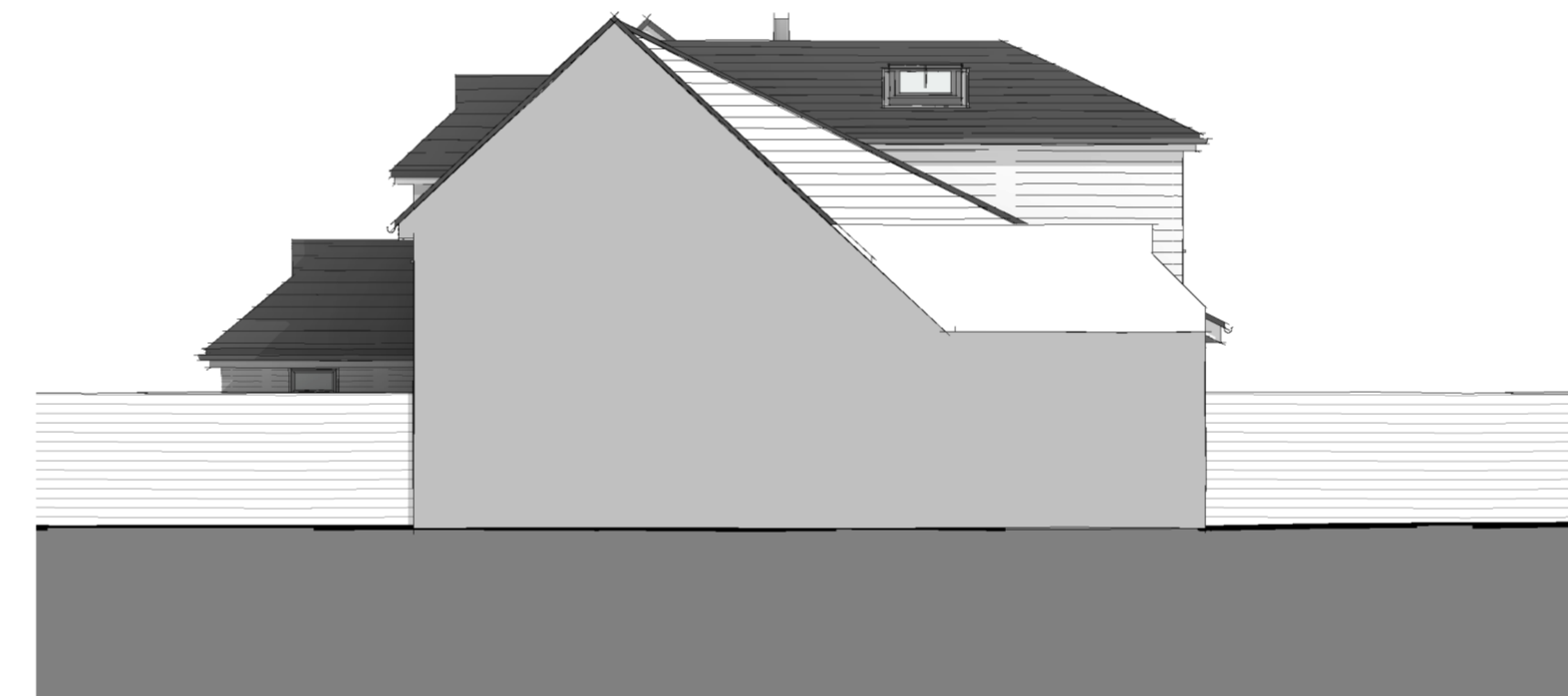
Proposed Side 2 Elevation