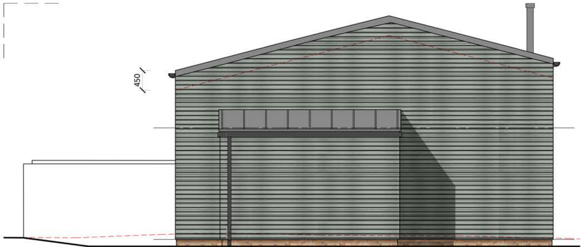
Proposed Side Elevation Scale 1:50