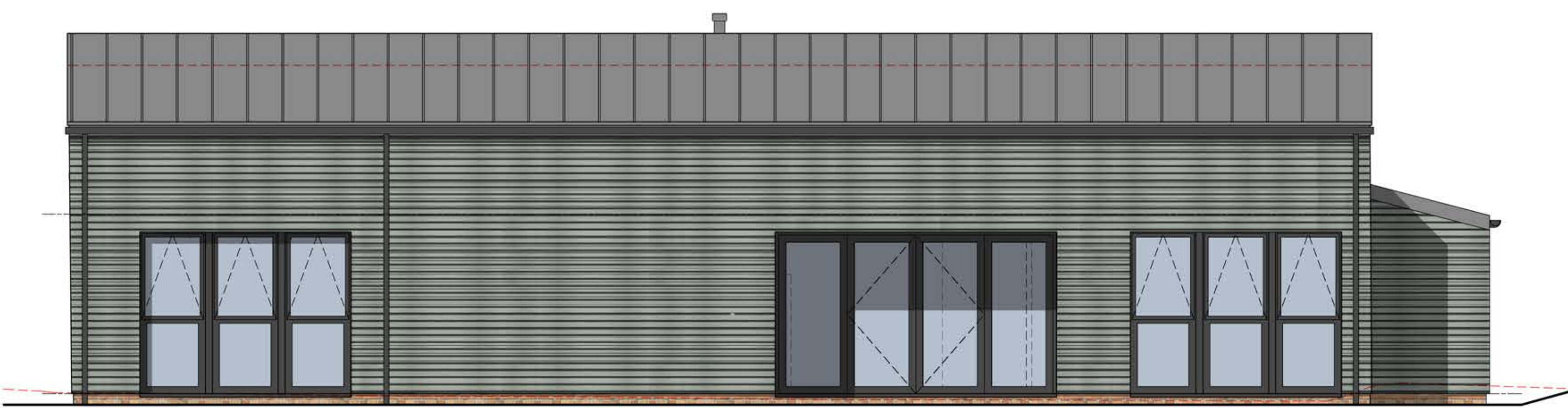
Proposed Front Elevation Scale 1:50