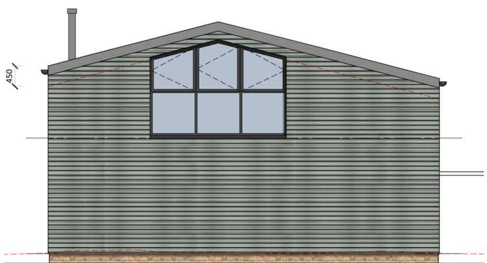
Proposed Side Elevation Scale 1:50