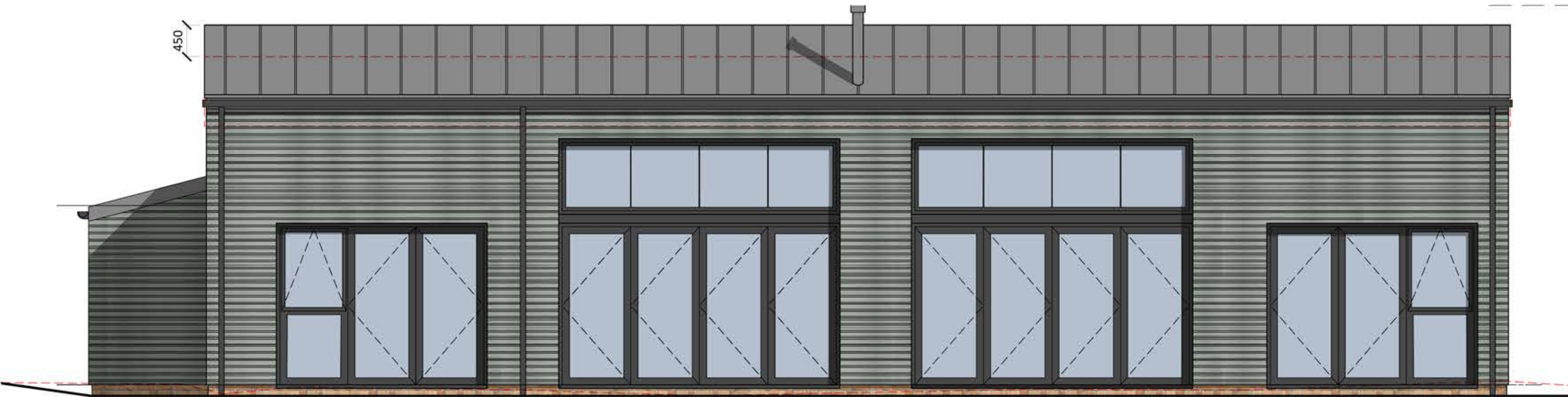
Proposed Rear Elevation Scale 1:50