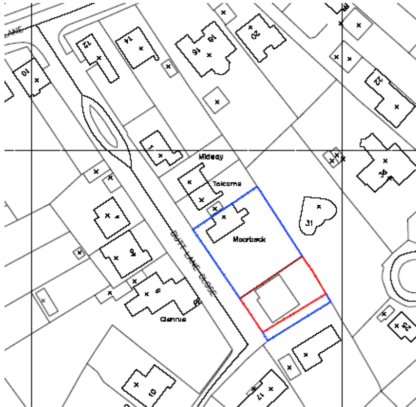
Existing Site Plan

The adjacent houses in Butt Lane Close are large family homes with the general appearance being a mixture of brick and render treatment. We have adopted the design principle of the surrounding area in the creation of one 3 storey 4 bed and one 2 storey 3 bed semi detached houses; these have been split into 3 vertical elements in terms of elevational treatment to reduce the overall appearance in size. To further reduce the appearance in height, dormer windows have been introduced taking pointers from within the immediate area, and the window fenestration replicates that which has been used on the adjacent Moorbeck property. The 2 storey 3 bed semi detached house represents a significant 'stepping down' of the development, which is further emphasised by the sloping nature of the site.