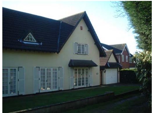
View of number 15 Butt Lane Close