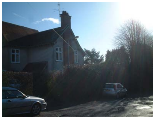
Moorbeck Street elevation

The adjacent houses in Butt Lane Close are large family homes with the general appearance being a mixture of brick and render treatment. We have adopted the design principle of the surrounding area in the creation of one 3 storey 4 bed and one 2 storey 3 bed semi detached houses; these have been split into 3 vertical elements in terms of elevational treatment to reduce the overall appearance in size. To further reduce the appearance in height, dormer windows have been introduced taking pointers from within the immediate area, and the window fenestration replicates that which has been used on the adjacent Moorbeck property. The 2 storey 3 bed semi detached house represents a significant 'stepping down' of the development, which is further emphasised by the sloping nature of the site.