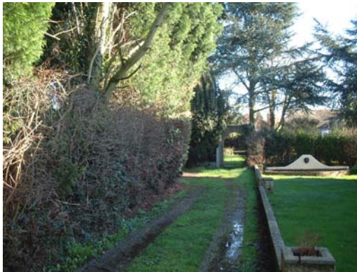
View along private drive