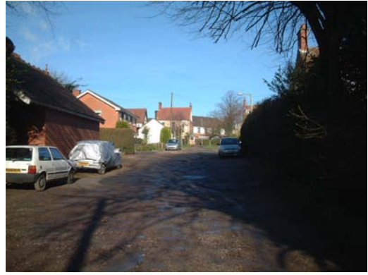
View up Butt Lane Close