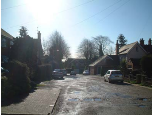
View down Butt Lane Close