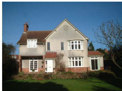
Moorbeck view from garden