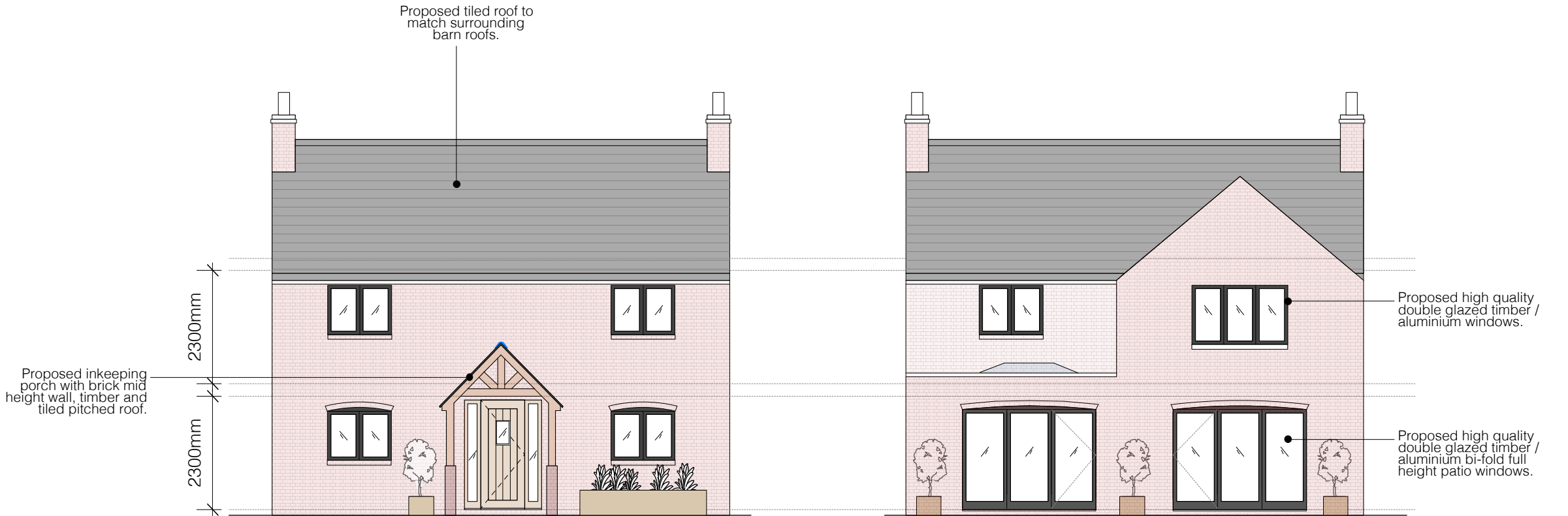
1 proposed front elevation