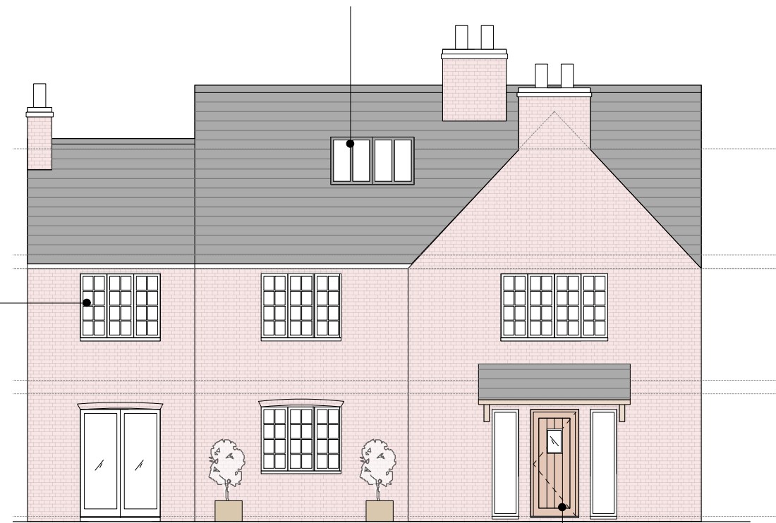
2 proposed rear elevation (north west) (facing the rear courtyard)

Proposed conservation style rooflights in rear facing roof slope.