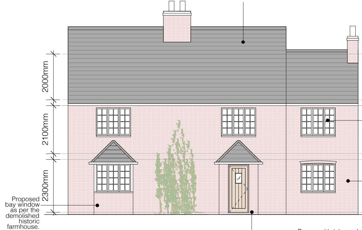
1 proposed front elevation (south east) (facing Main Road)

Proposed design with dual pitched tiled roof with chimneys and facing red brickwork has been carefully designed to be inkeeping and similar in design, mass, footprint and scale to the demolished historic farmhouse.