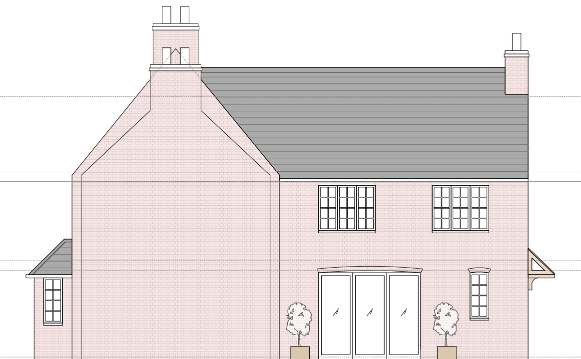
4 proposed side elevation (north east)

Proposed opaque and fixed side window into master ensuite.