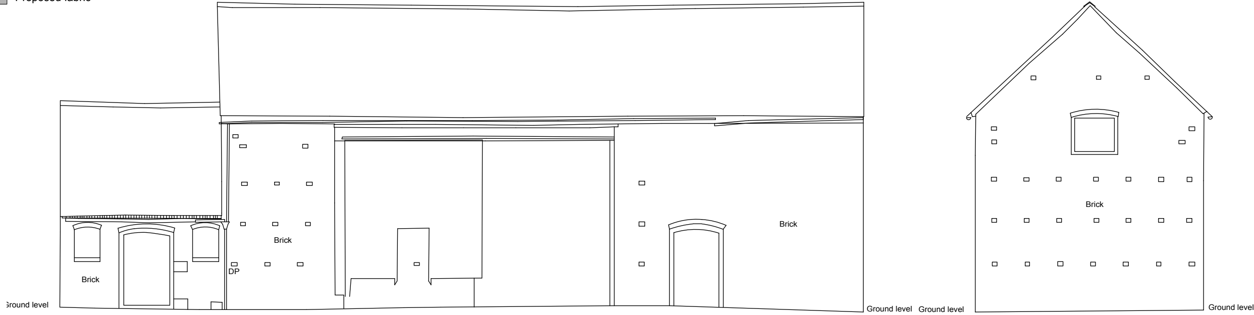
1 existing front elevation (south)