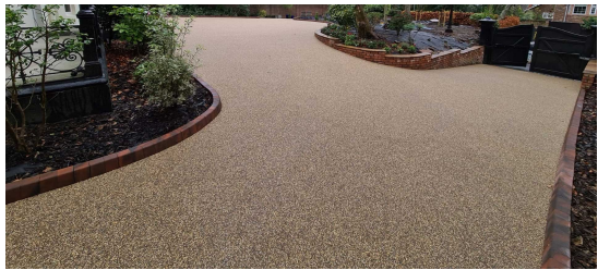
STONE RESIN DRIVEWAY EXAMPLE