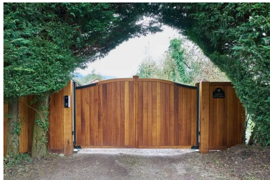
SOLID TIMBER GATE EXAMPLE