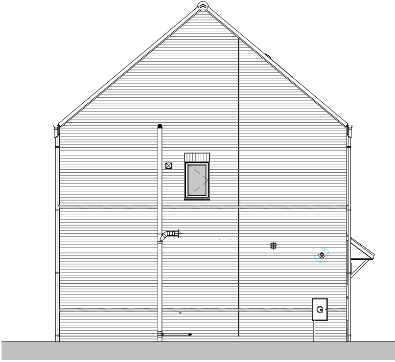
Left Side Elevation 1 : 100