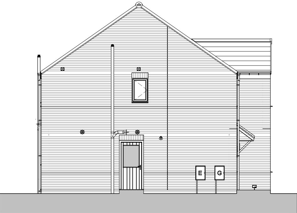
Left Side Elevation 1 : 100