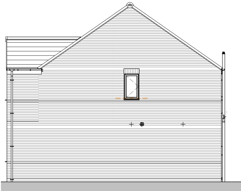
Right Side Elevation 1 : 100