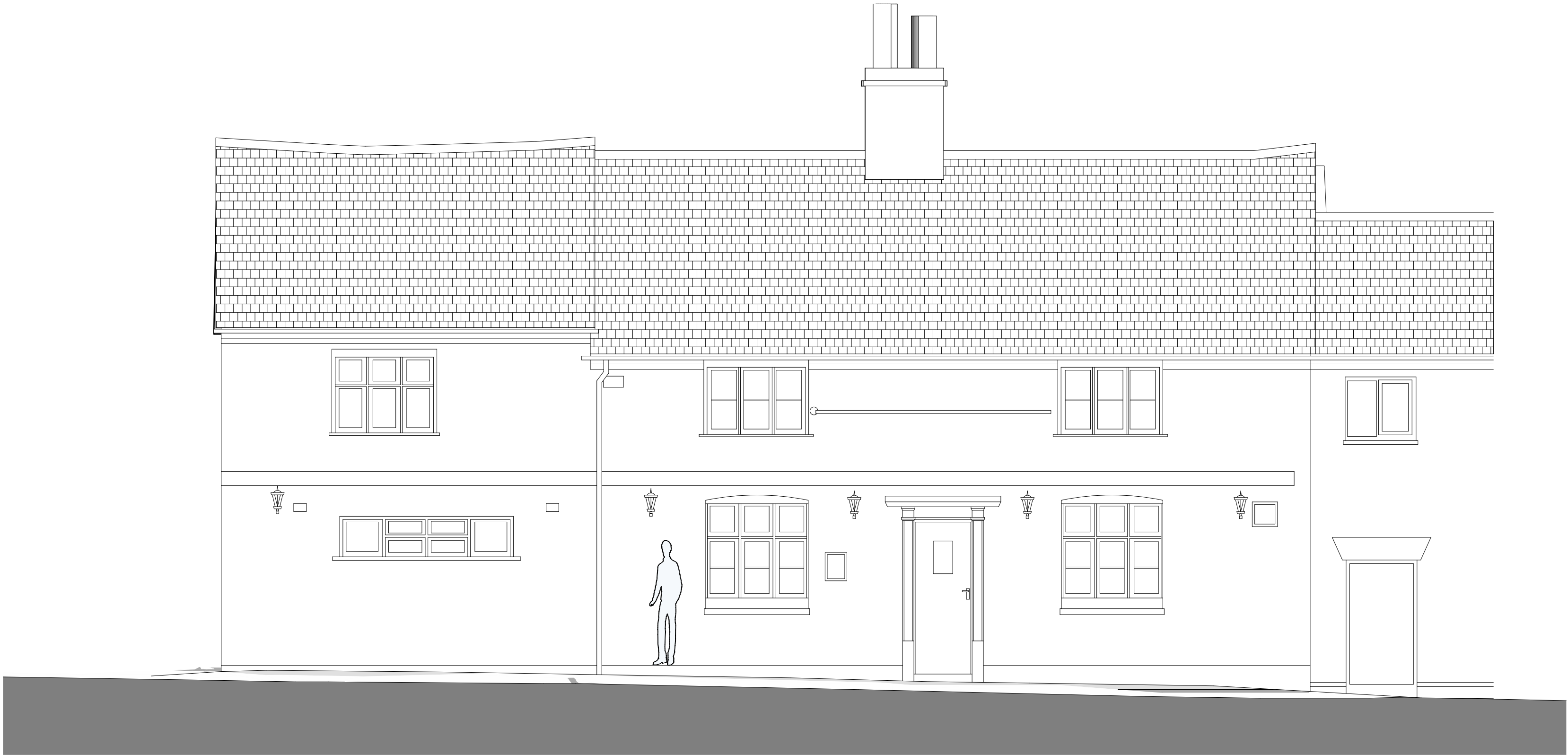
Elevation to East