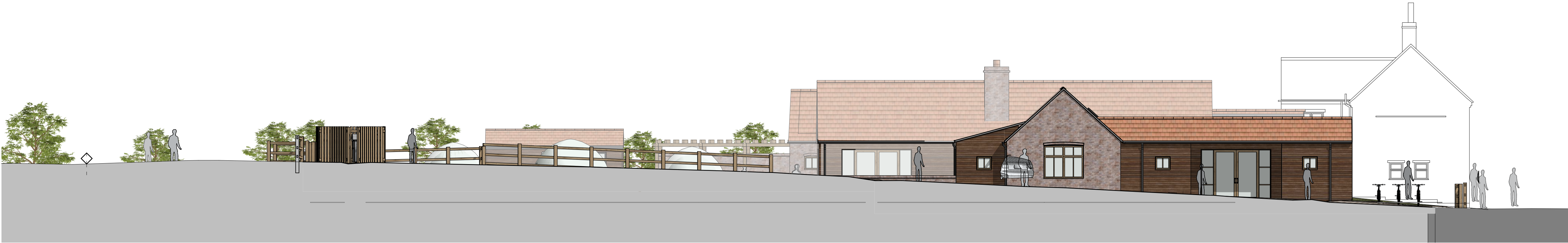
Street Elevation to North Es-02