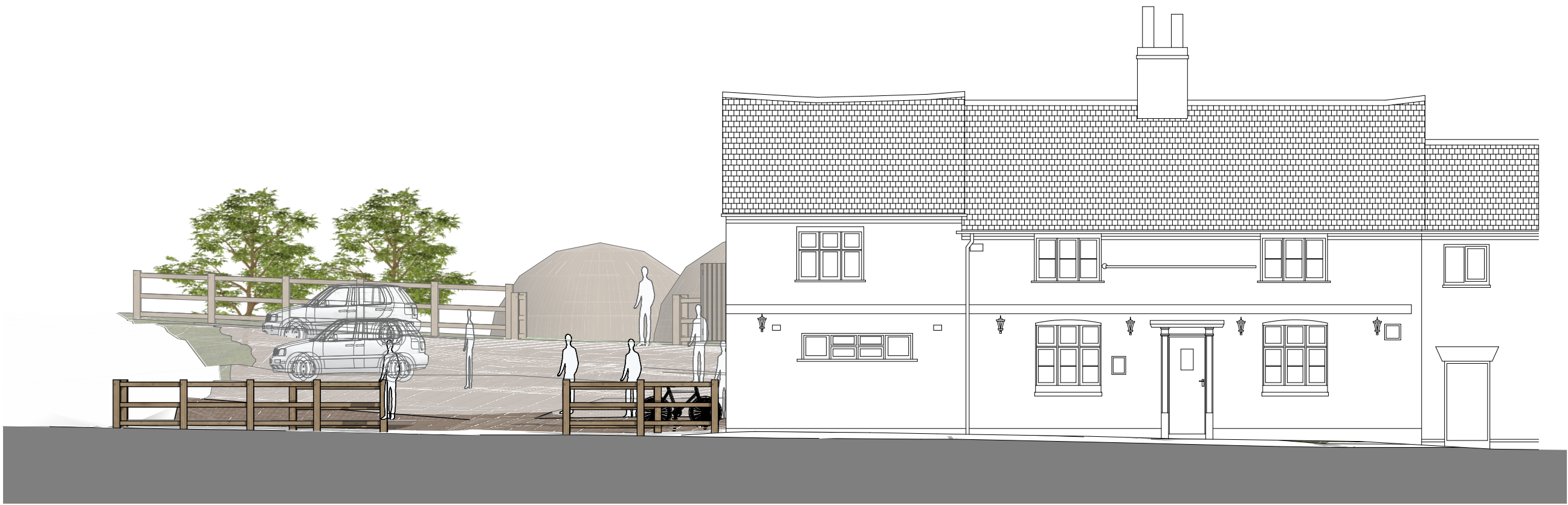
Street Elevation to East Es-01