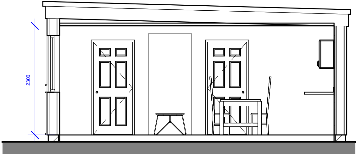
1 | Building Section 1 : 50