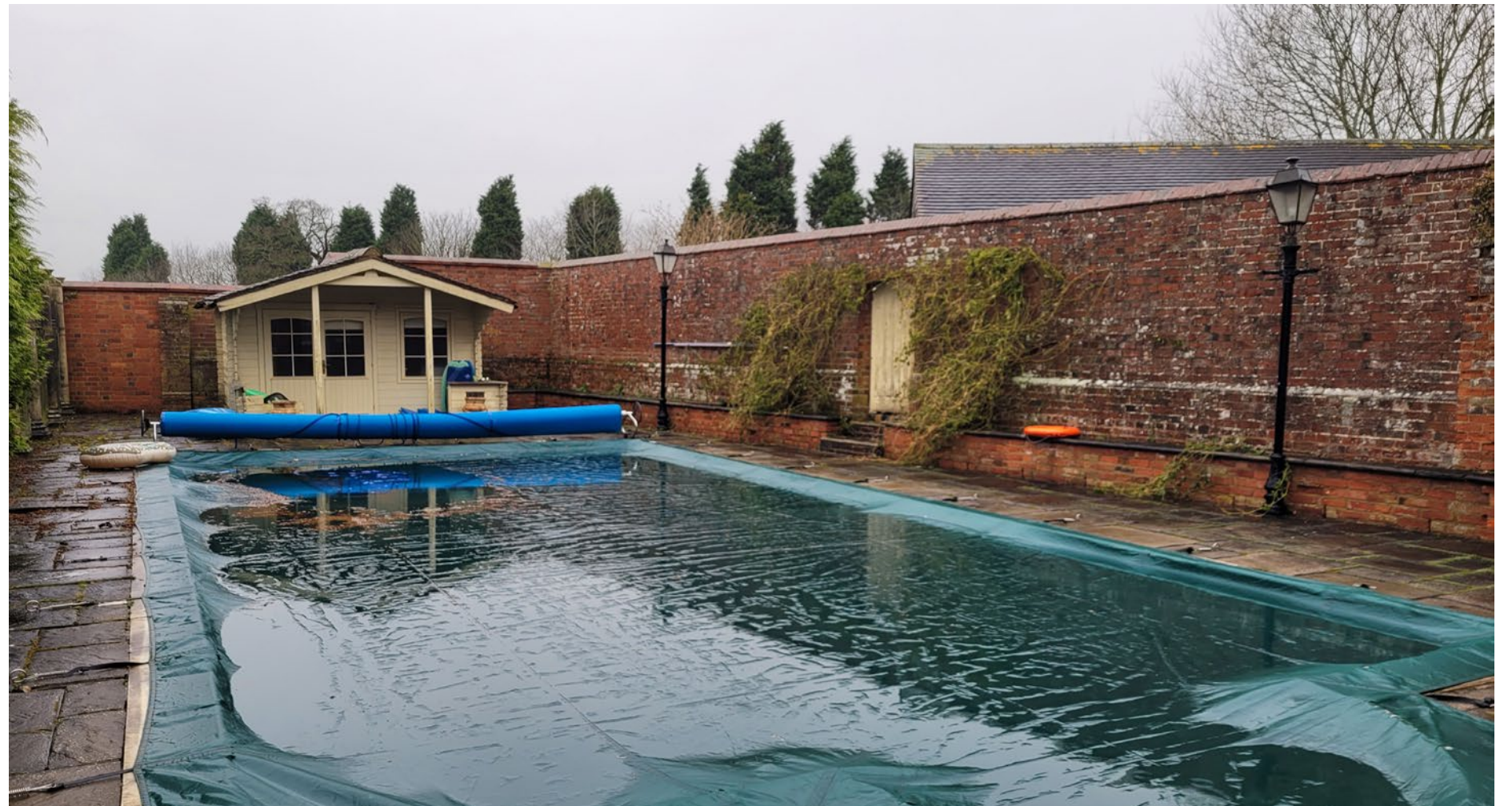
Figure 4: Existing Pool House

As seen in Figures 5 and 6, the landscape appears somewhat dated and would benefit from sensitive upgrading to better reflect the character of the hall and its setting. The existing pool house is of an inappropriate style—its small scale and off-the-shelf appearance sit uncomfortably alongside the hall, failing to respond to its proportions or architectural presence. In addition, several 20th-century sculptures and columns have been introduced which do not relate to the historic character of the site and detract from the overall composition of the landscape.