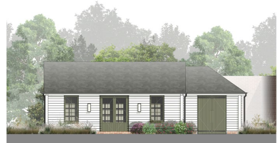
Barn 02 - Elevation 01 1 : 50