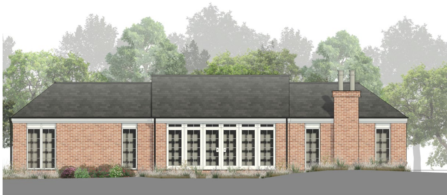
Barn 01- Elevation 03 1 : 50