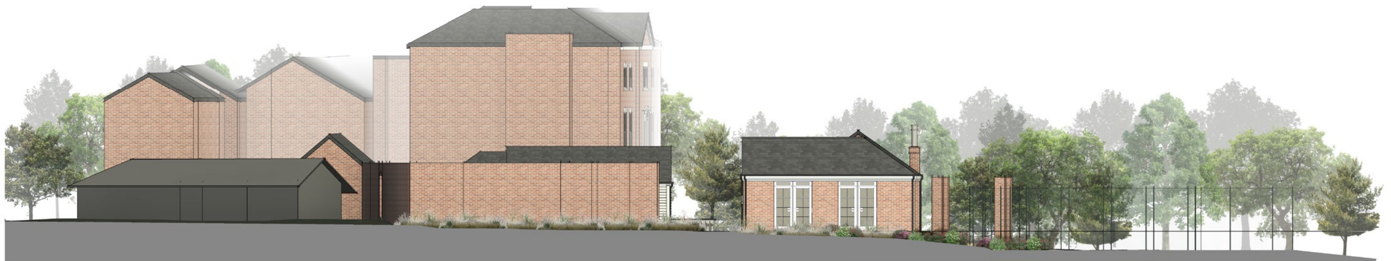
Proposed Site Elevation 02 - Dependent 1 1 : 100