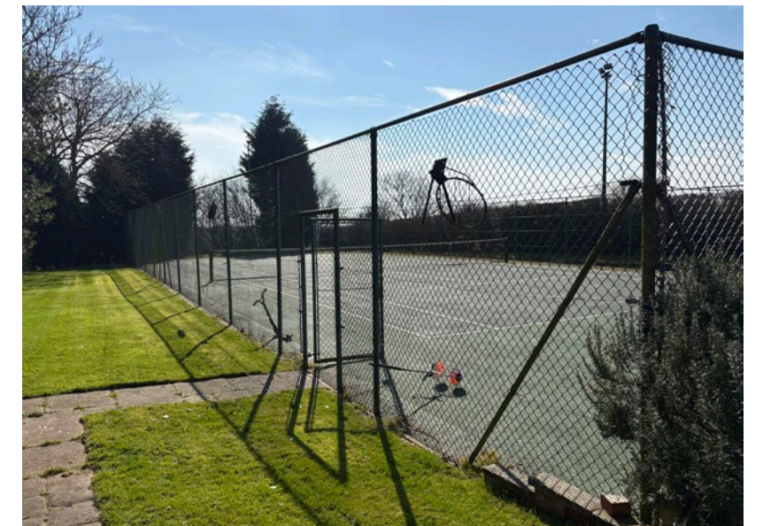
Figure 6: Existing Tennis Court