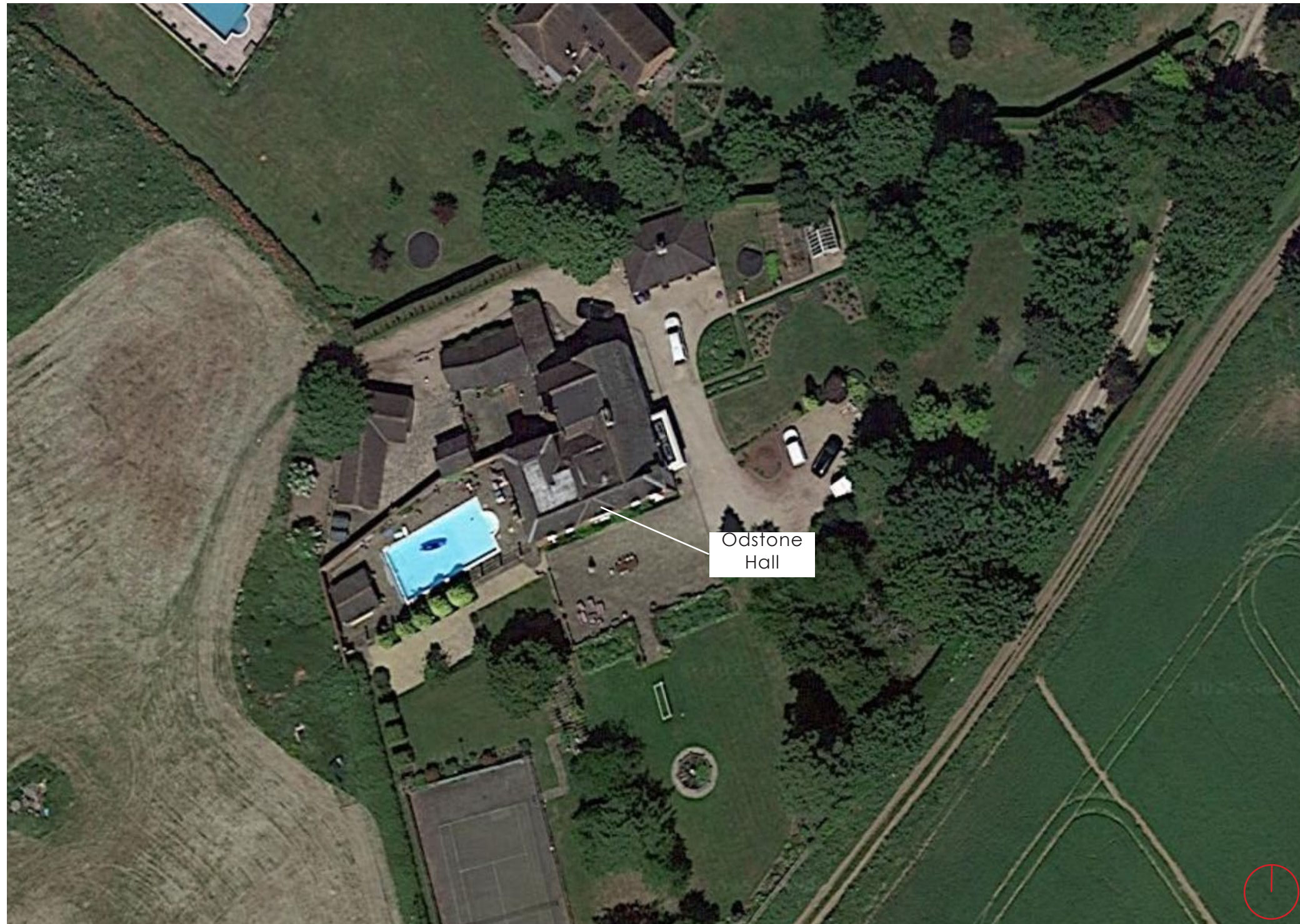
Figure 1: Satellite map of area surrounding Odstone Hall (Google Earth)