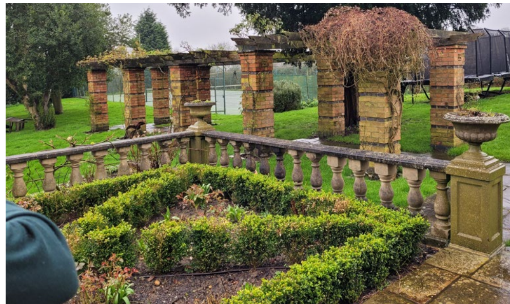
Figure 5: Existing brick pergola