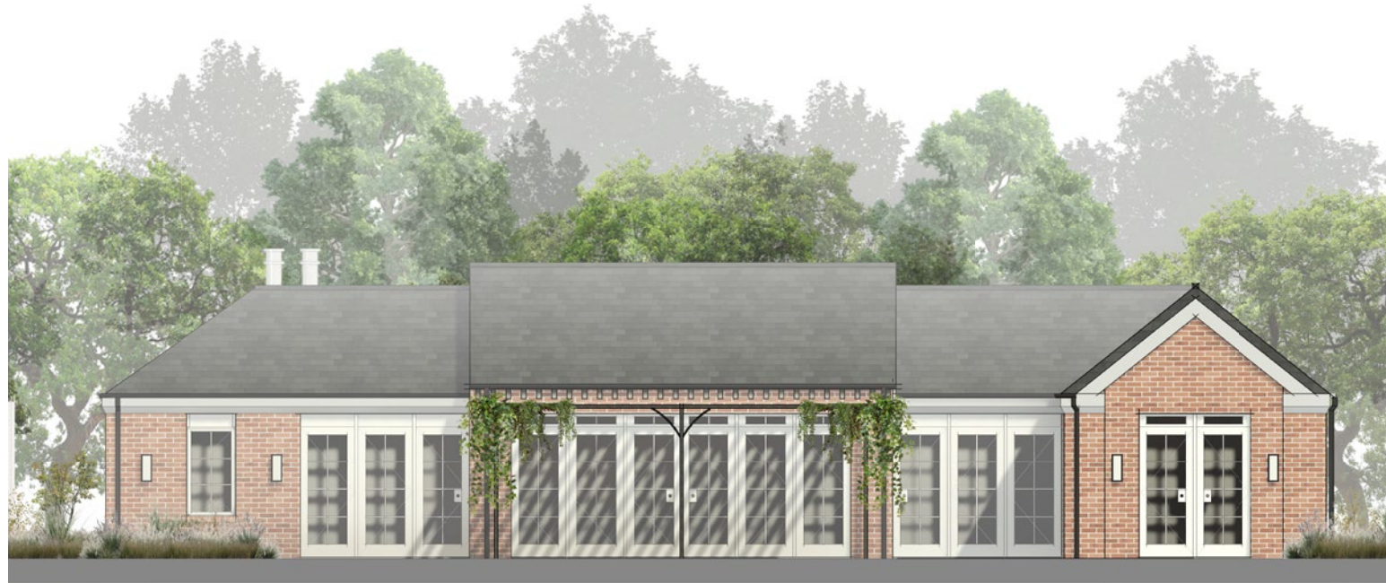
Barn 01 - Elevation 01 1 : 50