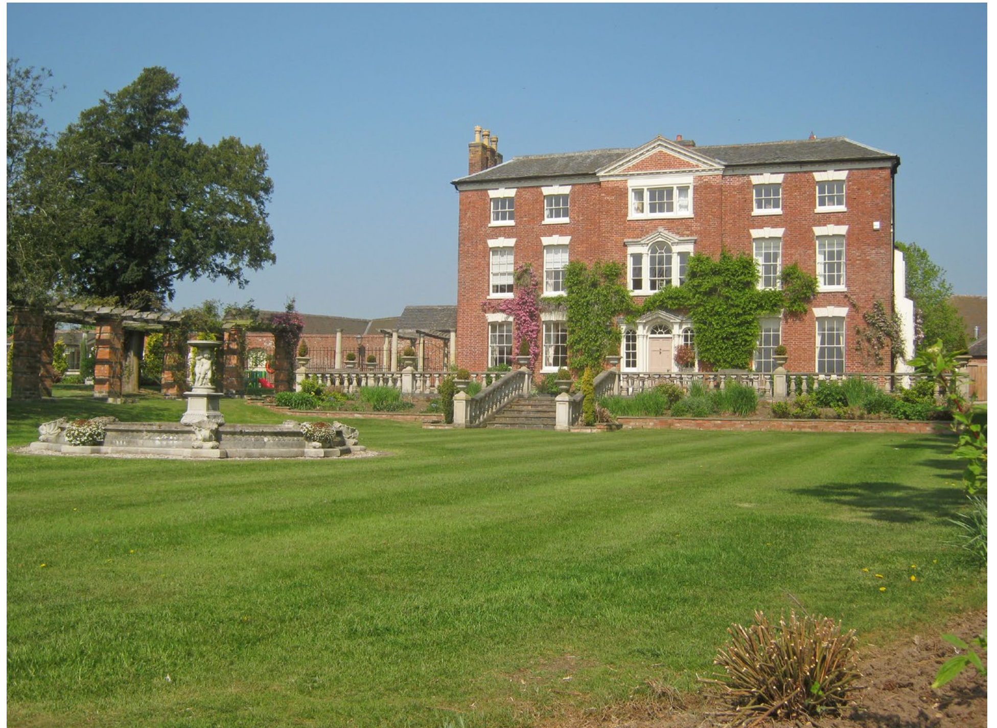
Figure 3: Current Odstone Hall