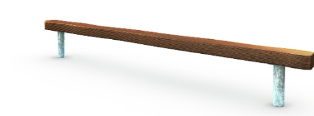
5 - Troll's Balance Beam