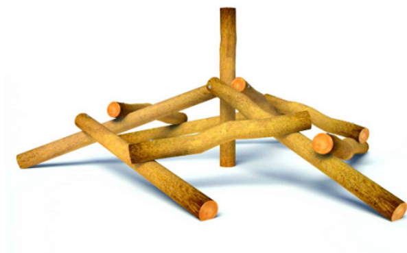
4 - Trunk Pile