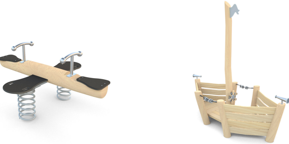
1 - Ninetales Robinia Spring See-Saw 2 - Psyduck Robinia Play Unit