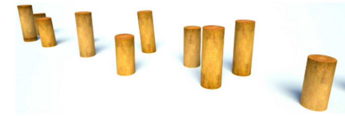
3 - Stepping Posts