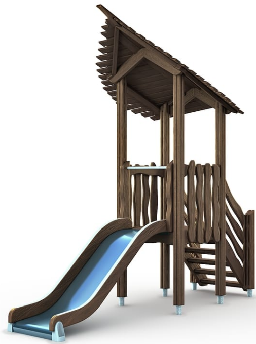
4 - Fairy Burrow