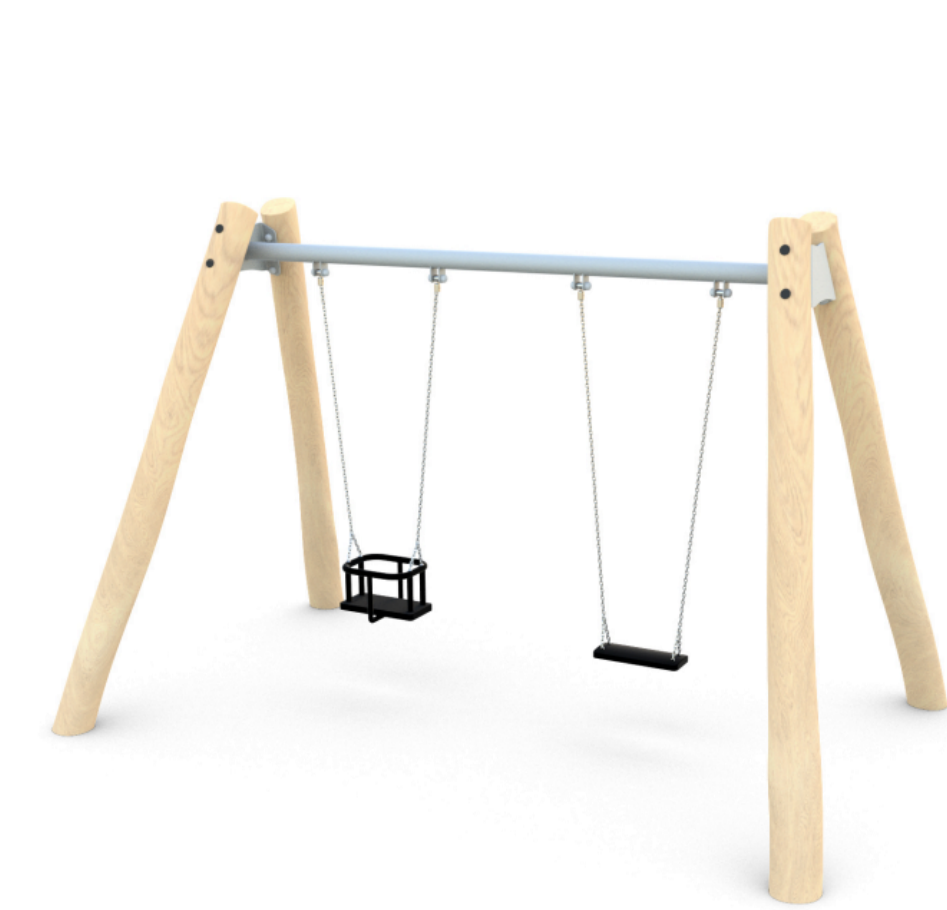
1 - Pidgley Robinia Swing