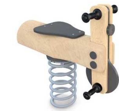
2 - Arcanine Robinia Spring Rider