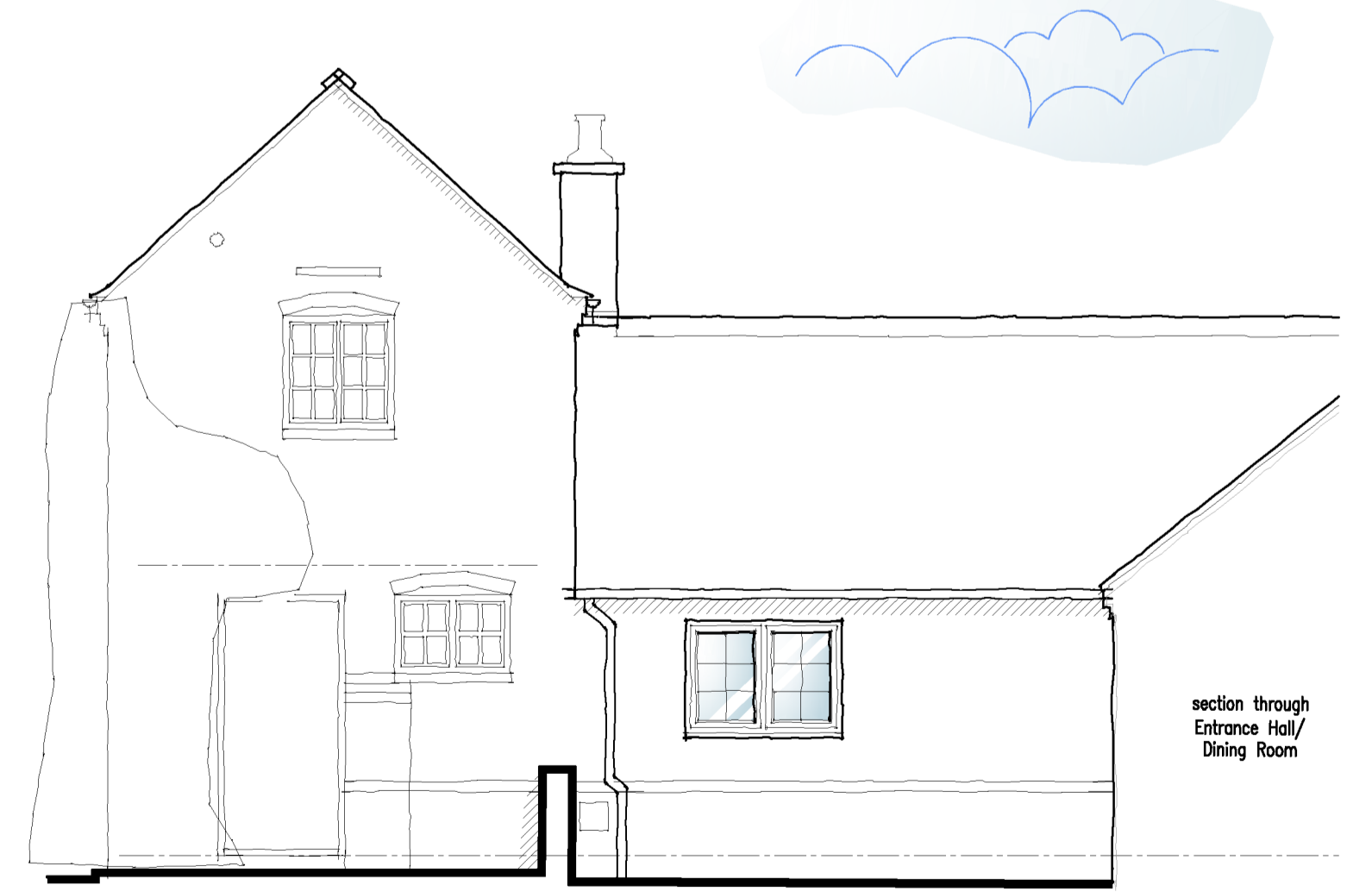
Proposed Internal Side Elevation Scale 1:50

Revisions: DG DAVID GRANGER ARCHITECTURAL DESIGN LTD David Granger Architectural Design Ltd The Old Cottage Hospital Leicester Road Ashby de la Zouch Leicestershire LE65 1DB Project Proposed Extensions and Alterations The Cart Shed Help Out Mill Shackerstone Client Mr and Mrs K. Garnett Drawing Detailed Planning Proposals Sheet 2 of 3 Drawing Number 25.4556.11 Date: October 2025 Scale: As Shown Drawn By: WF Checked By: SM