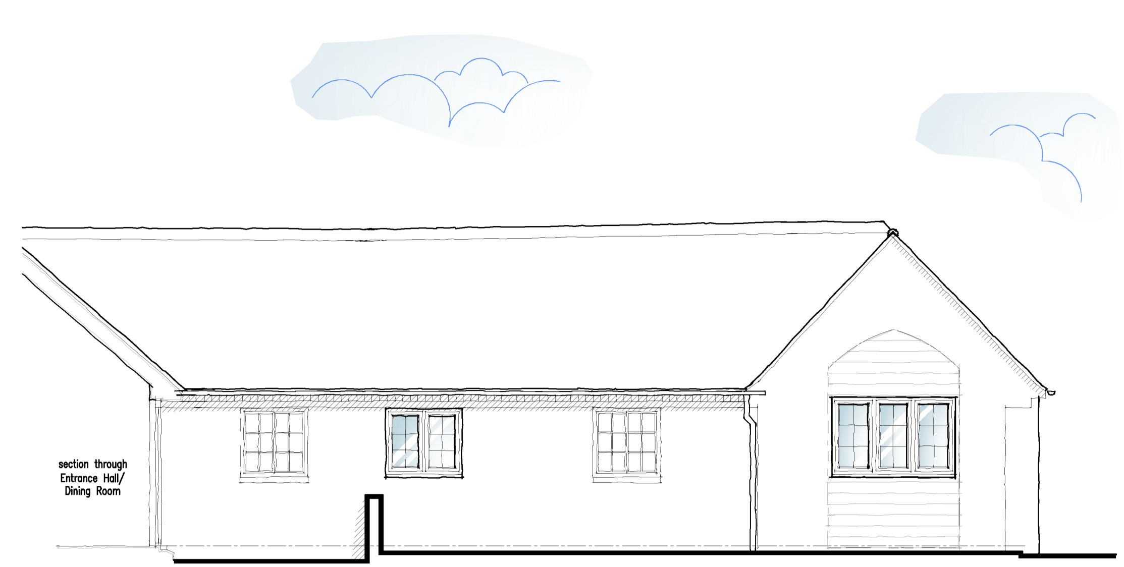
Proposed Internal Side Elevation Scale 1:50