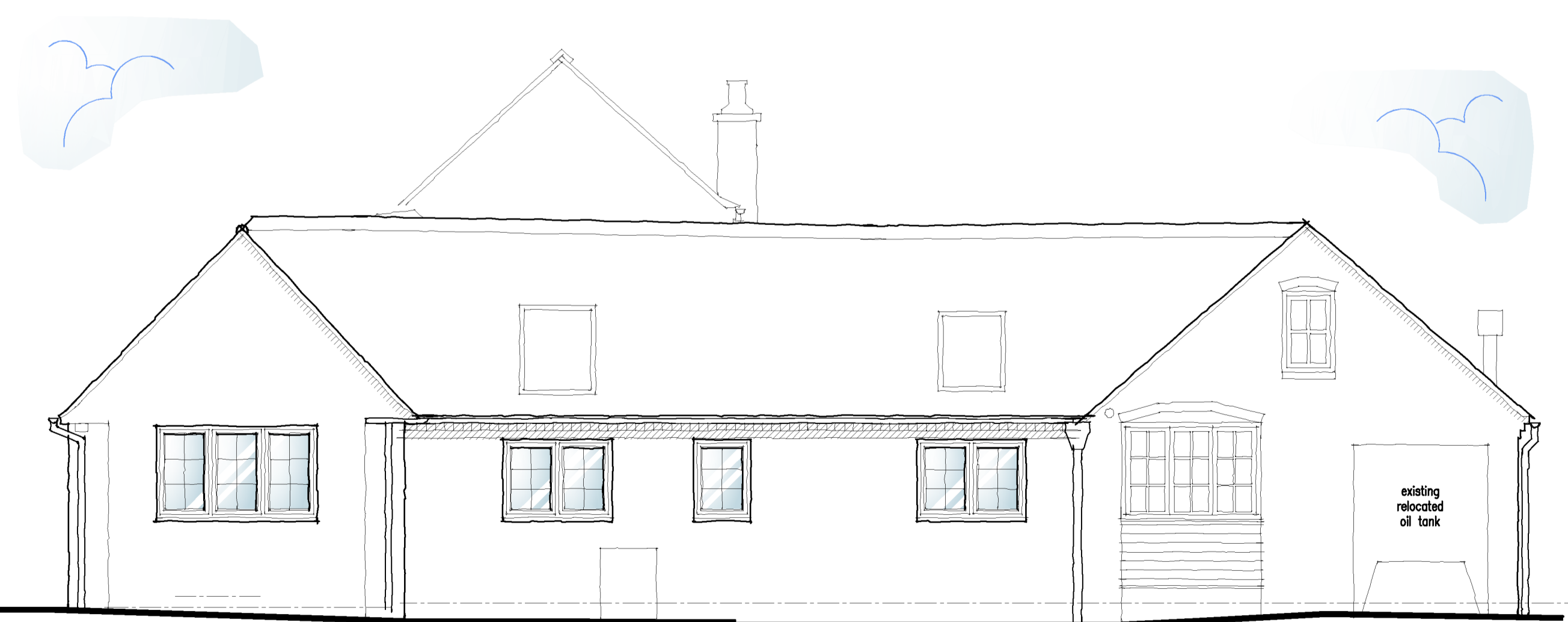
Proposed Side Elevation Scale 1:50