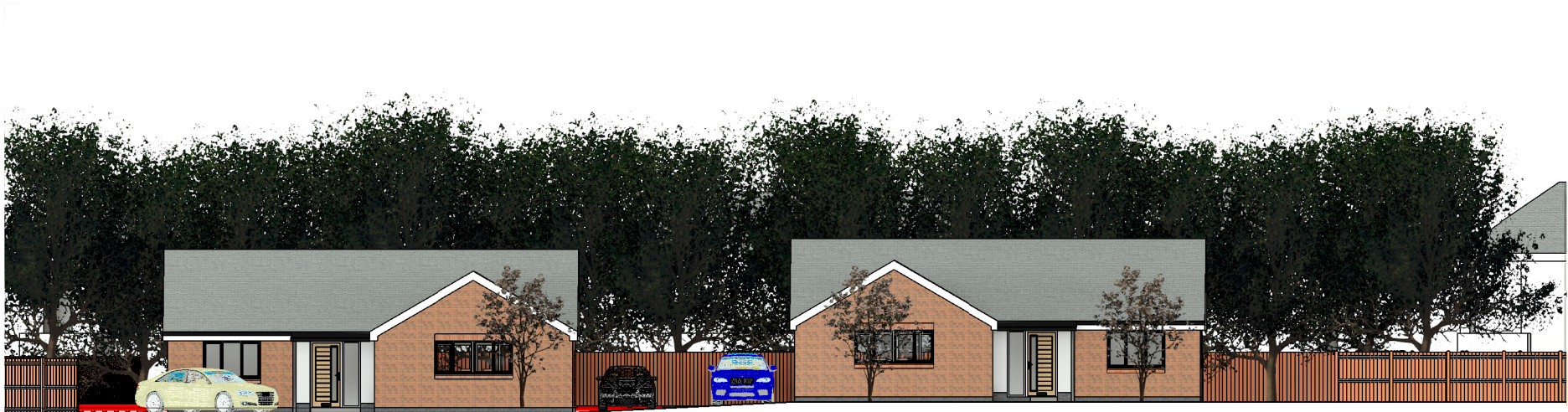
Street elevation of plots 1 & 2