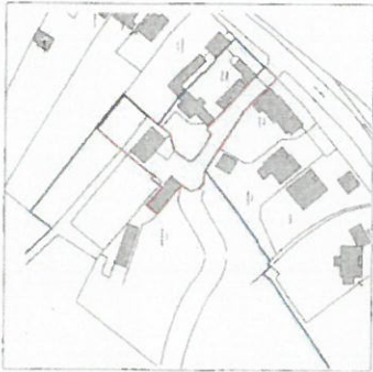
Site Location Plan Scale 1:1250