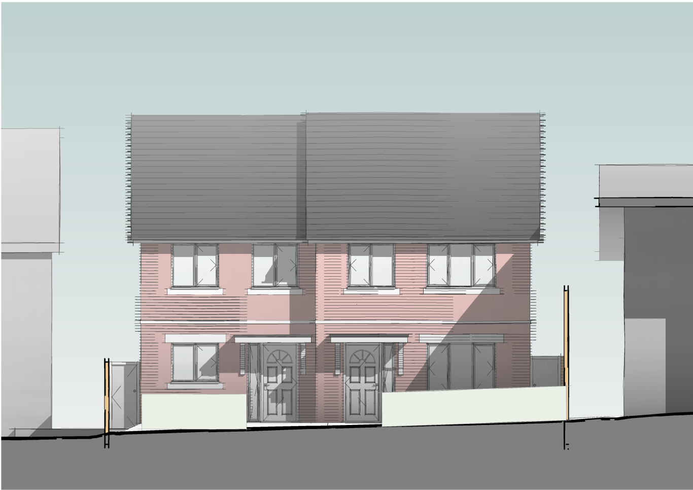
Street Elevation - Westerly 1 : 100