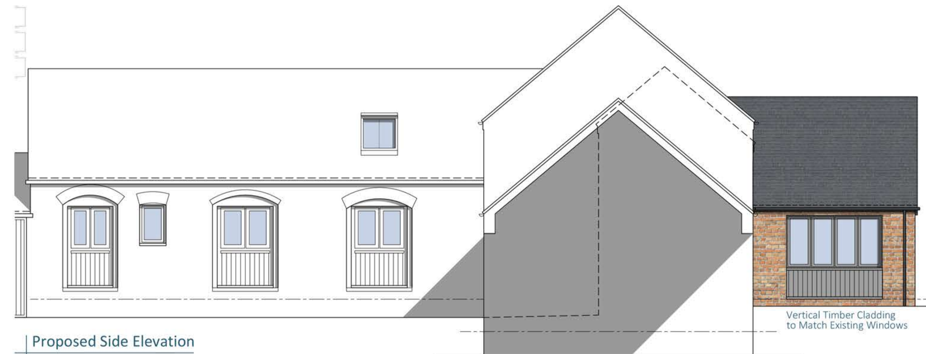
Proposed Side Elevation Scale 1:50

Vertical Timber Cladding to Match Existing Windows