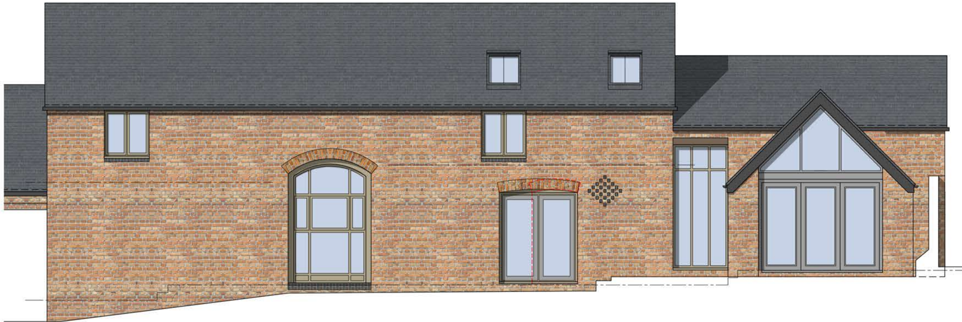
Proposed Rear Elevation Scale 1:50