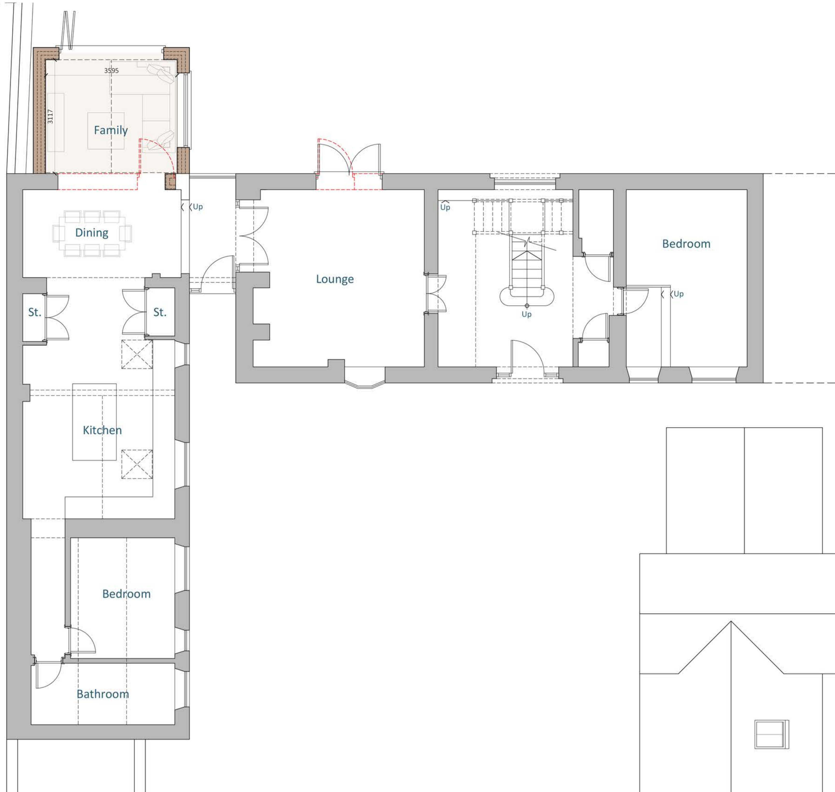
Proposed Ground Floor Plan Scale 1:50