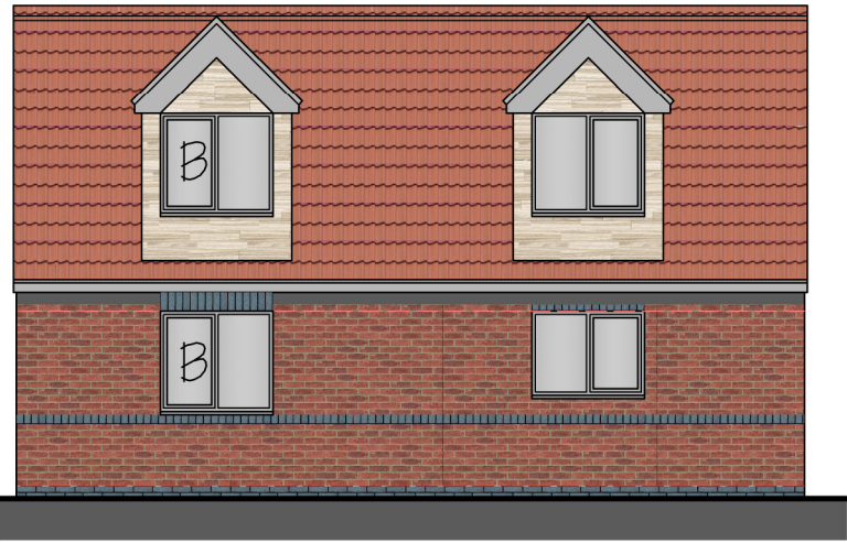
Rear (W) Elevation 1:100