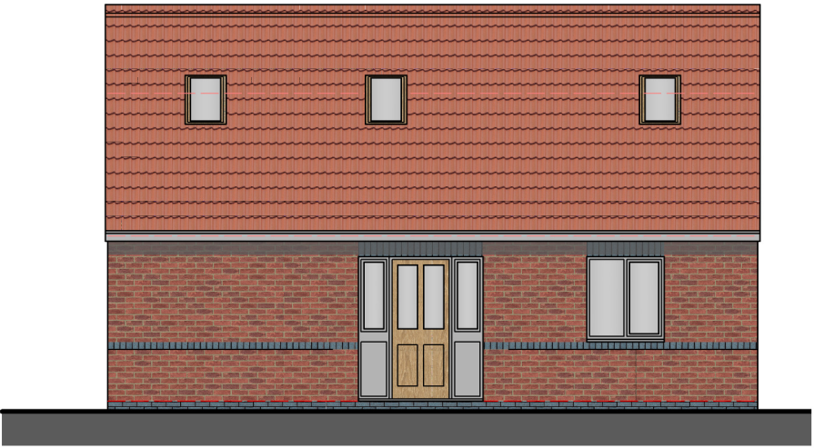
Front (E) Elevation 1:100

Notes Ground floor GIA = 48.3m 2 First Floor GIA (over 1.5m head room) = 26.5m 2