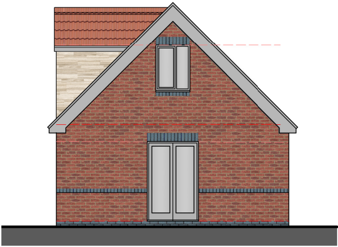
Side (S) Elevation 1:100