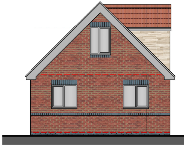
Side (S) Elevation 1:100

sturch Tel: 07948 382917 e:lsturch@gmail.com