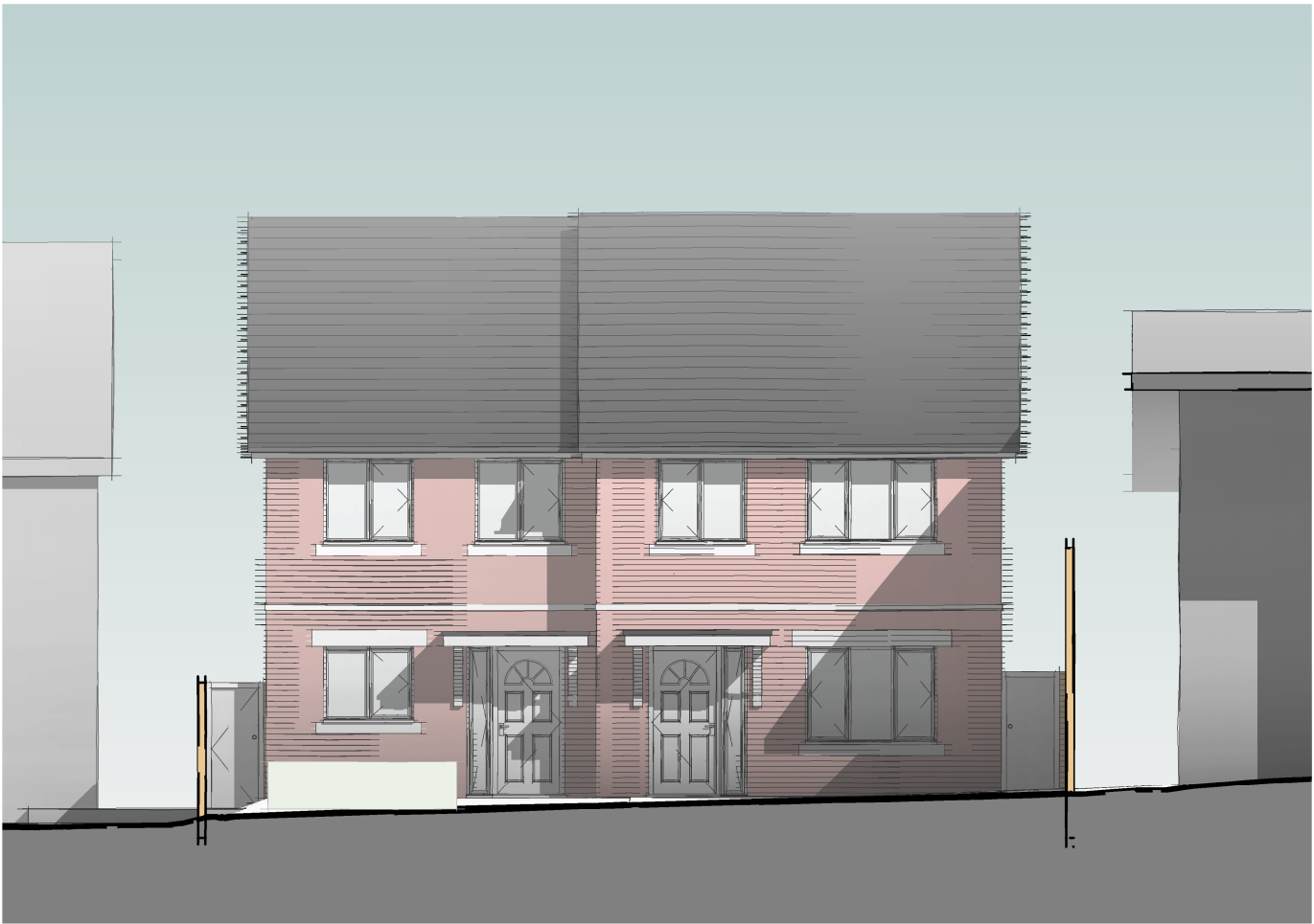
Street Elevation - Westerly 1 : 100