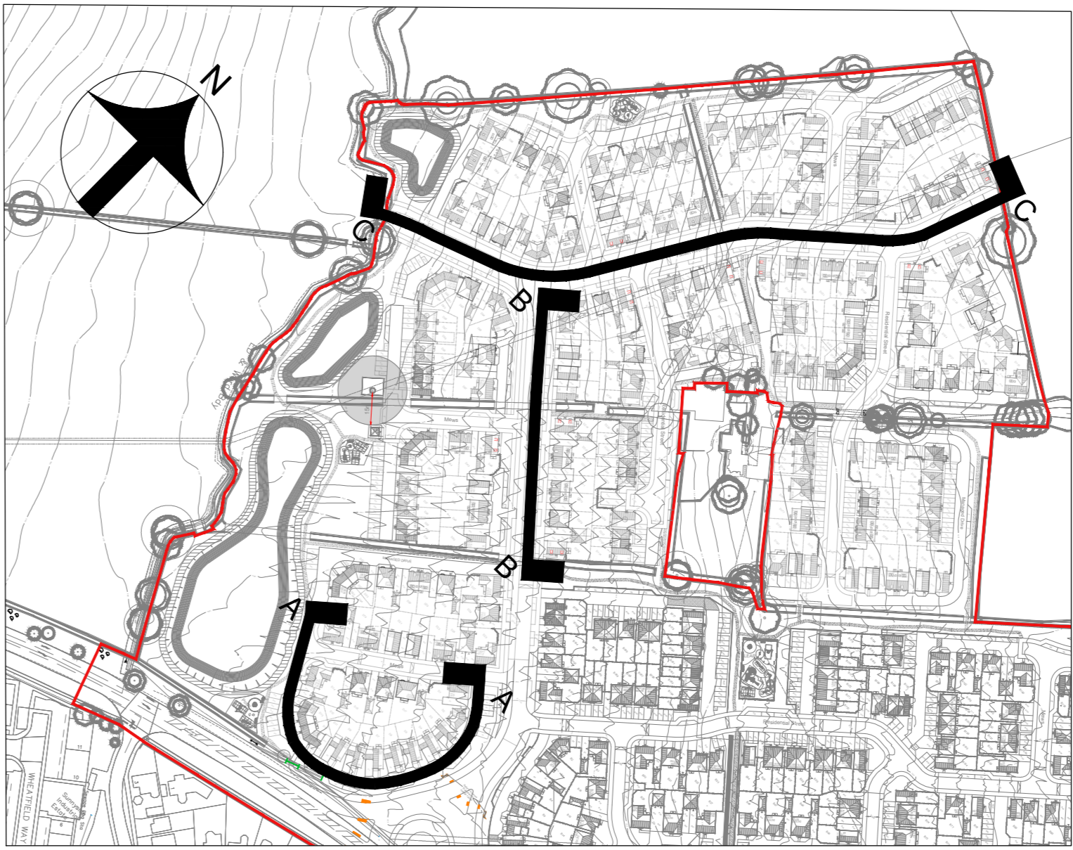
STREET SCENE LOCATION PLAN - SCALE 1:2500

WARNING: TO HOUSE-PURCHASERS. Property Measurements Act 1991. Buyers are warned that images and site layout are intended for illustrative purposes only and should be treated as general guidance only. The layout, including parking arrangements, [social/ affordable] housing, community buildings, play areas and public open spaces may change to reflect changes in the planning permission for the development. Please speak to your solicitor to whom full details of any planning consents including layout plans will be available. The layout and landscaping are not intended to form part of any contract or warranty unless specifically incorporated in writing into the contract. [ACCESS is a marketing name only and may not be the designated postal address, which may be determined by the local (HRA). The contents of this drawing do not constitute a contract, part of any contract or warranty.