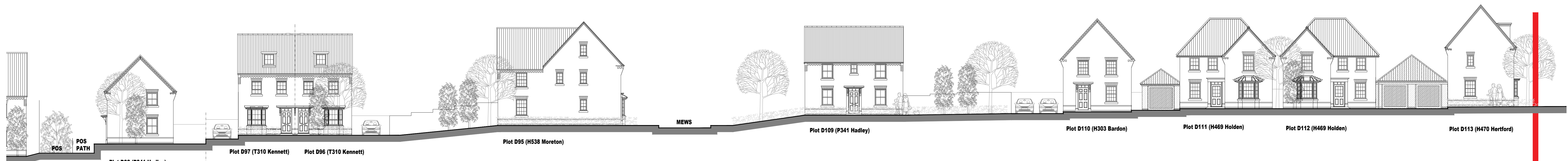
STREET SCENE C-C CONTINUED