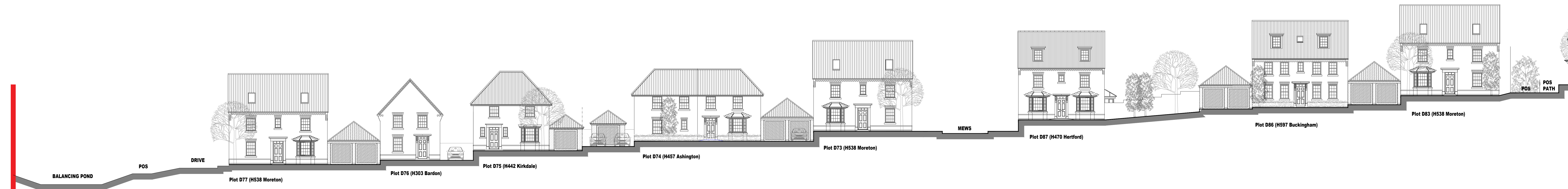
STREET SCENE C-C