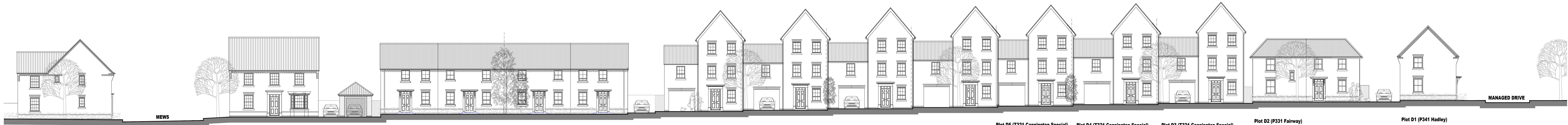
Plot D18 (H456 Avondale) STREET SCENE A-A