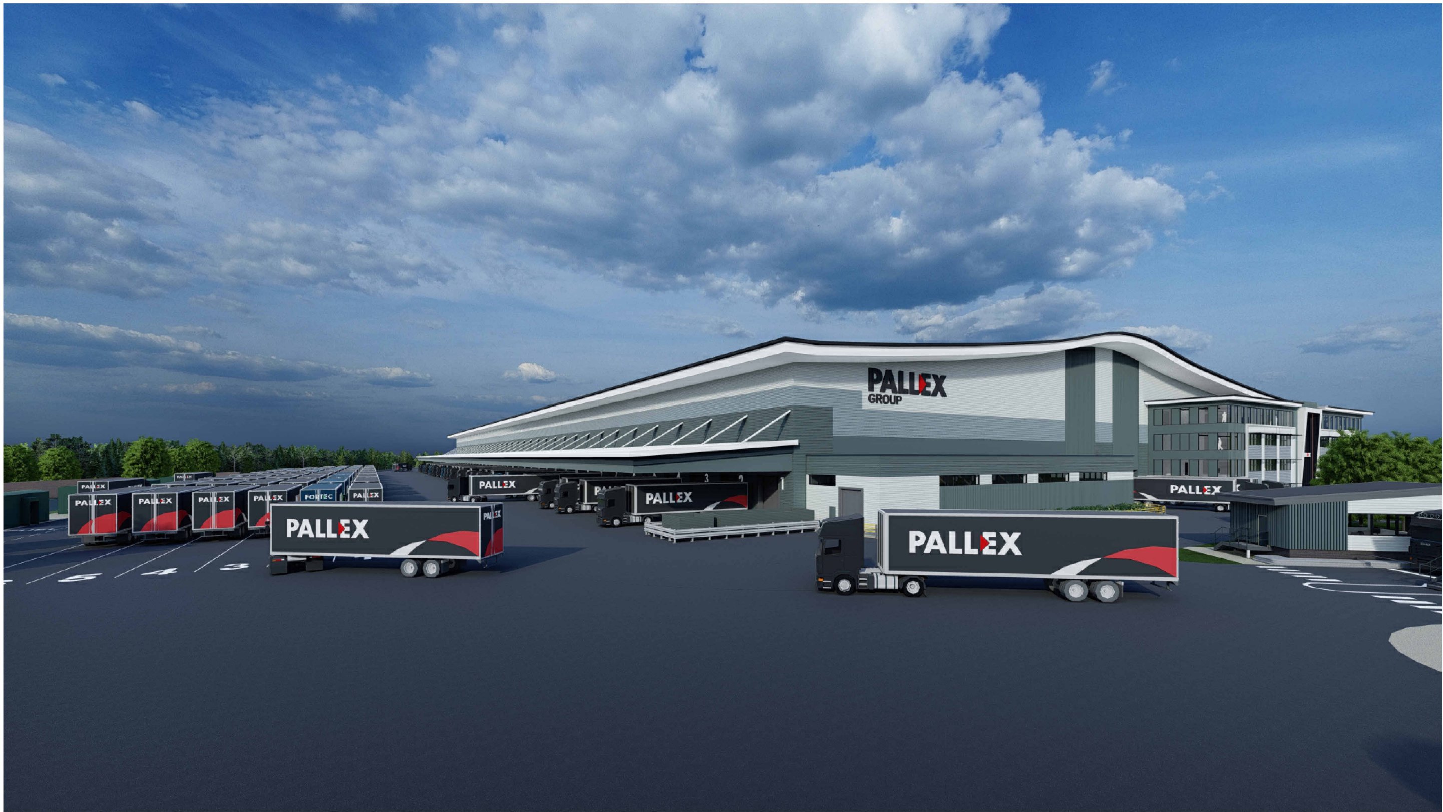
Proposed Loading Bays